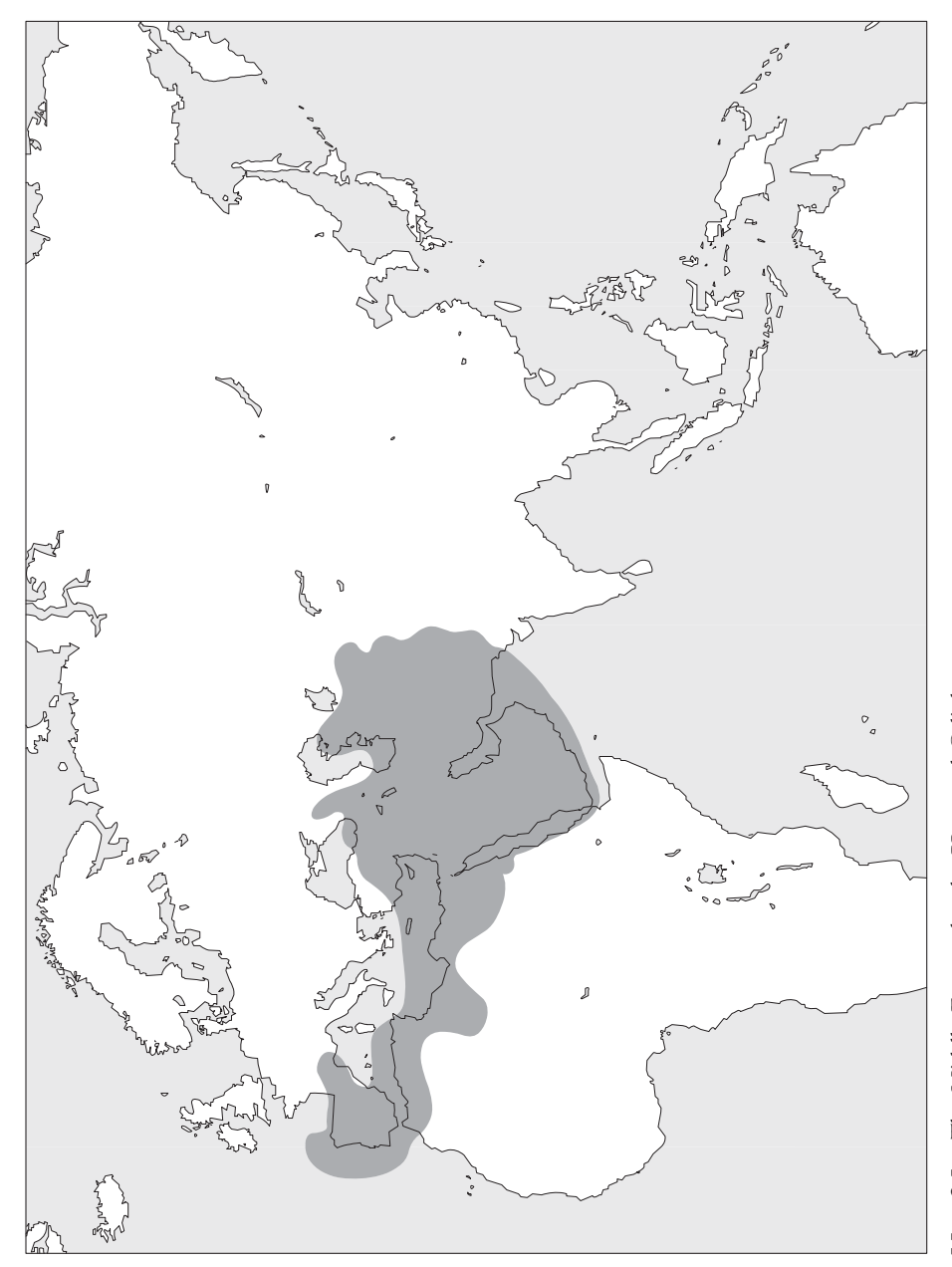
Map 3.1 The Middle East under the Umayyad Caliphate