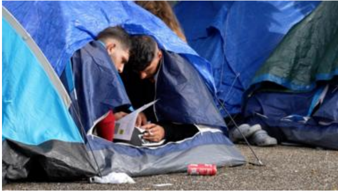
'People smuggling is more lucrative than drugs'