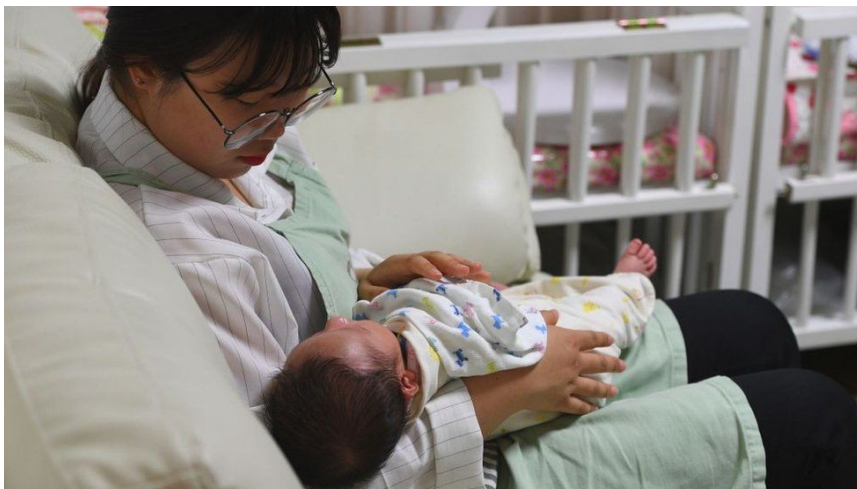
Alarm as South Korea sees more deaths than births