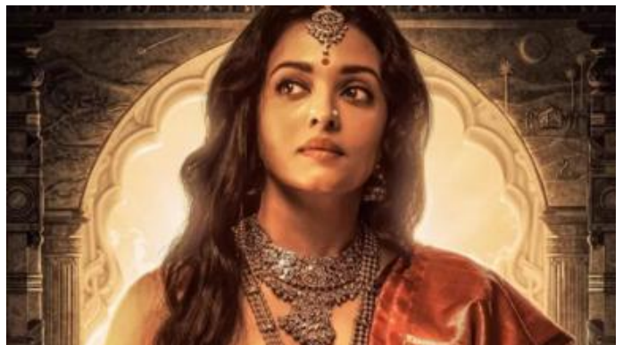
The Indian period drama firing up the box office