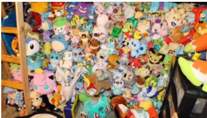
World's largest Pokémon collection may fetch £300k