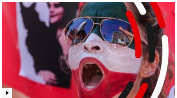
Ros Atkins on... Iran protests