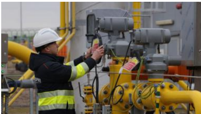
Why EU leaders struggle to agree on gas price cap