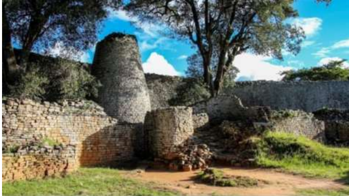
The African city Europeans tried to erase