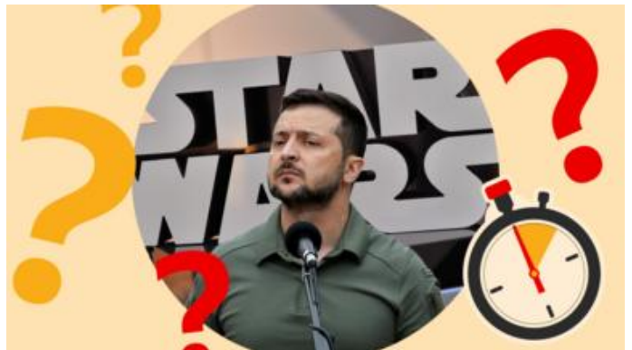
What was Zelensky's Star Wars link? Take our timed quiz...