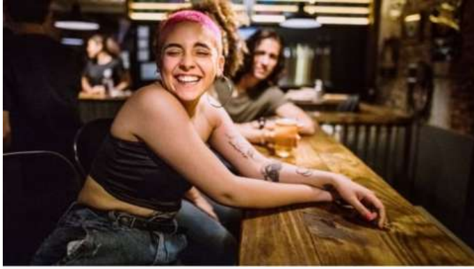
Why Gen Z are drinking less