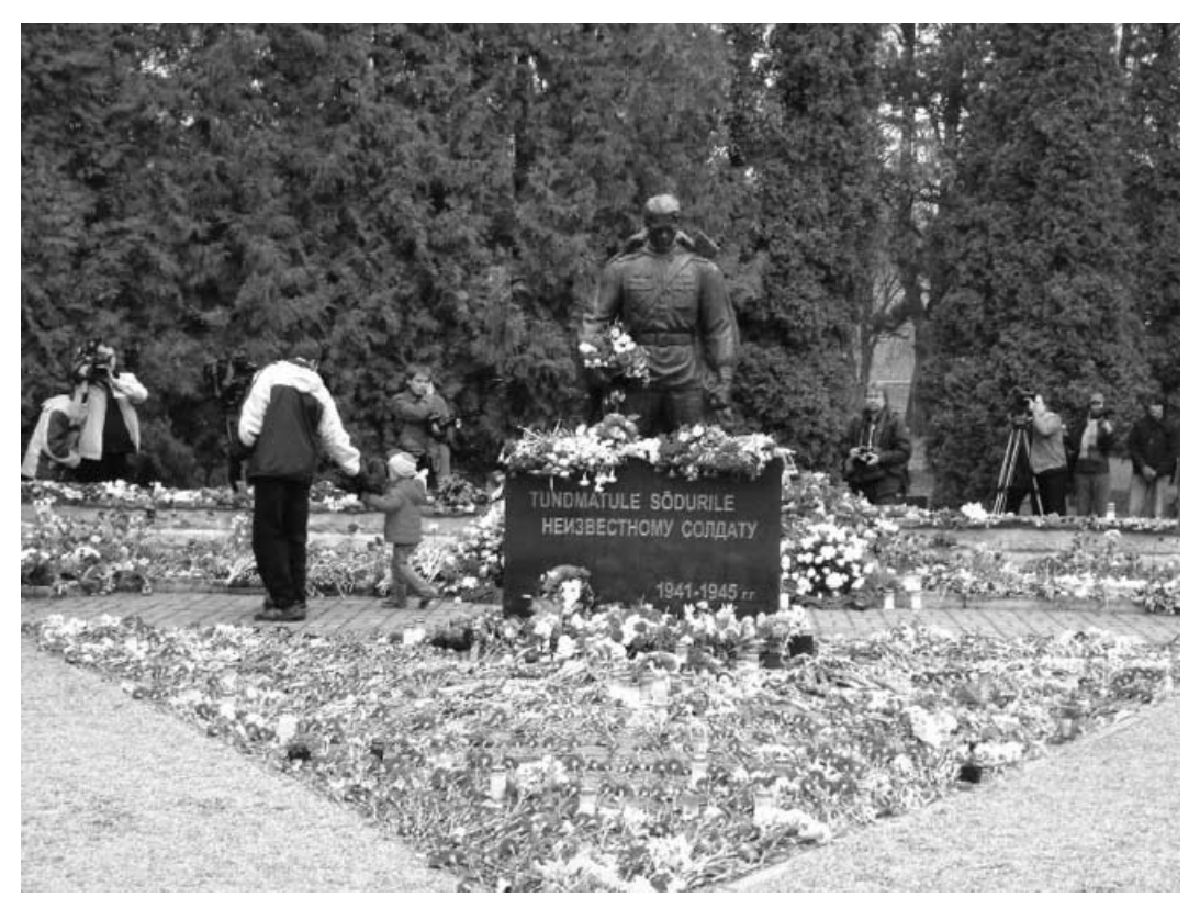
Figure 3. Bronze Soldier at its current location at Tallinn war cemetery