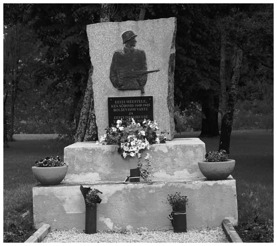
Figure 2. Lihula monument at its current location in the Museum of Fight for Estonia's Freedom, source: Wikipedia, DJ Sturm, 23 June 2008

statue. Nationalist Estonians experienced the demand for dismantlement as a lack of understanding by Western Europeans of the Estonian experiences in World War II (Burch and Smith 2007: 914), and felt ignored by their national government that obeyed the "external" requests.