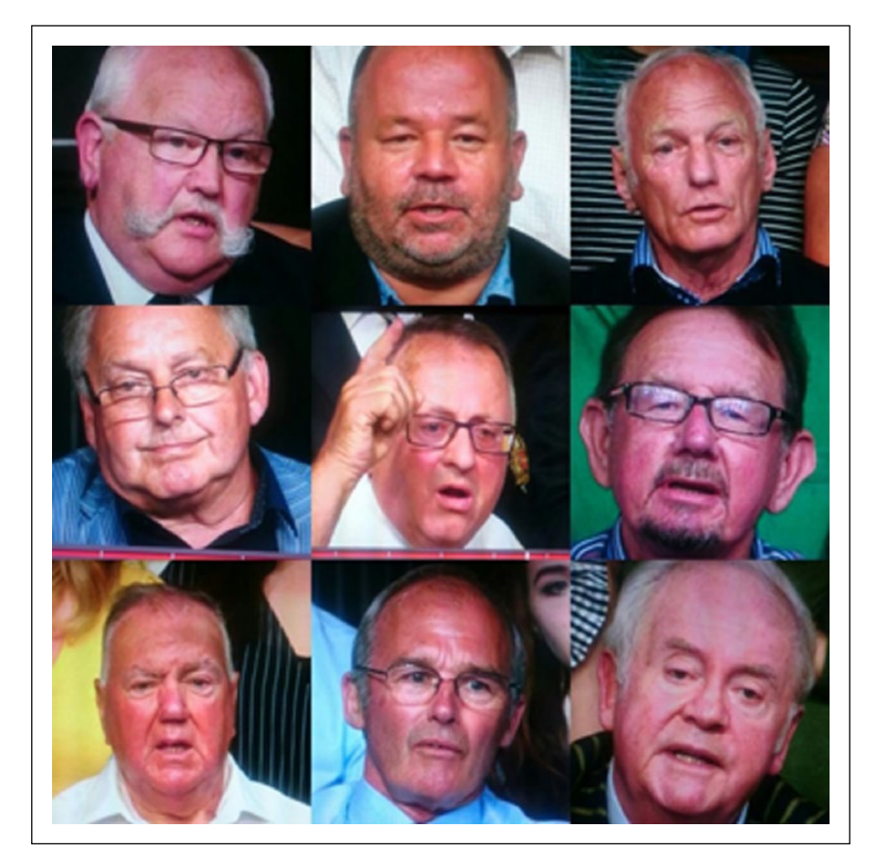
Figure 2. The 'Wall of Gammon' (Originally Posted by @bendavis_86, 08/06/17).

unremarkable part of the everyday vernacular of politics for large numbers of politically engaged citizens, and their playful character renders them profoundly affective insofar as they can be sources of pleasure, fun, connection or anger and irritation, depending on the context. Irrespective of whether one thinks the 'memeification' of British politics is a positive development, one should not underestimate its significance.