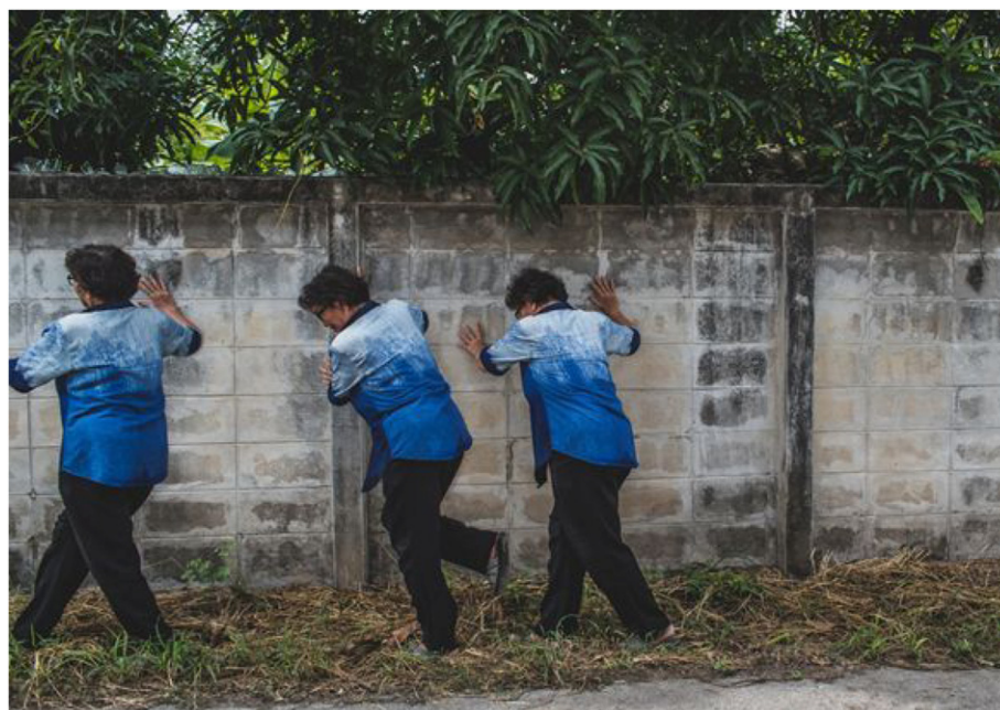
Figure 1. Composite photograph re-enacting an individual navigating the 2011 flood.

Hydraulic infrastructures also encompass the ways people might address natural disasters like flooding as a consequence of failed control. The causes as well as effects of natural disasters are hardly natural (cf Klinenberg 2002). In Nong Hoi in Chiang Mai, Thailand, the effects of the country's worst flooding in 2011 are still evident almost a decade later. Residents point to the mud stains on their walls, the tangible legacy of the devastating flood, and recount how they had to wade, neck-deep, through the floodwaters to supply food to those who needed it. They formed human chains during the flood to deliver food and supplies to vulnerable community members, grasping these walls of support where needed, as the walls were the only object visible above the brown waters (figure 1). Much of their property was destroyed, even the documents and ledgers sealed in drawers. Some have still not recuperated from this disaster, with leaking walls still being plugged by paper due to a lack of funds for repair.