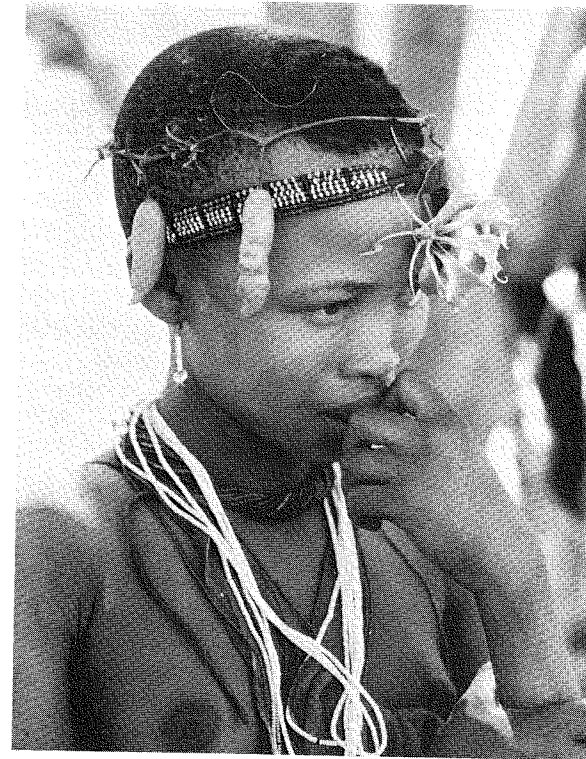
A young woman nearing the age of puberty and marriage.

Besides the proper kinship-name connection, the parents of a girl look for several other qualities in a son-in-law. He should be a good hunter, he should not have a reputation as a fighter, and he should come from a congenial family of people who like to do hxaro , the Ju/'hoan form of traditional exchange. The last criterion is tested before the marriage as the parents of the prospective bride and groom exchange a series of kamasi gifts to reinforce their relationship. If either side does not keep up the gift exchange, the deal may be called off and a new betrothal sought.