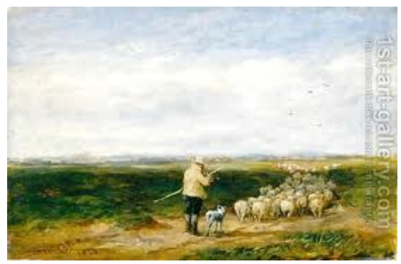
David Cox 'The Shepherd, Return of the Flock'