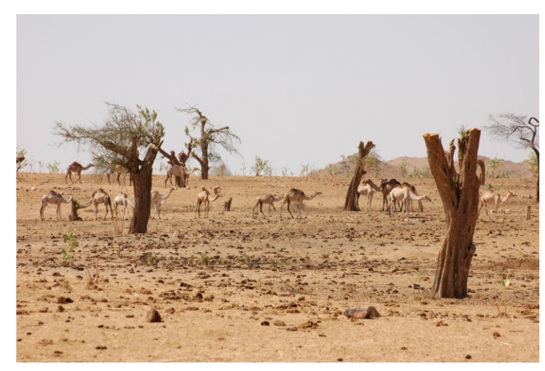
Camels graze in a destroyed village in Western Darfur