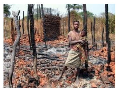
Poverty in the Congo