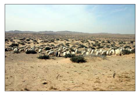
Overgrazing in Alxa League, western Inner Mongolia