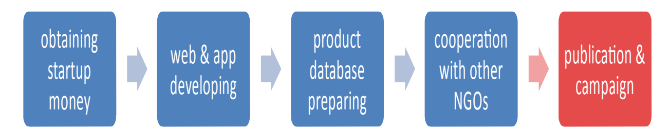
Blue colored part is internal part of campaigning and red is public part.

Campaigning of our NGO we would like to split into two parts – internal and public. In the internal campaigning part we will obtain money for start of our NGO and we will prepare our campaign. The second part is public and it means generally web administration, updates and communication with people.