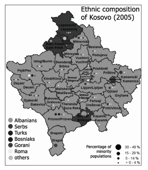
Figure 2. Geographical Distribution of Ethnicity