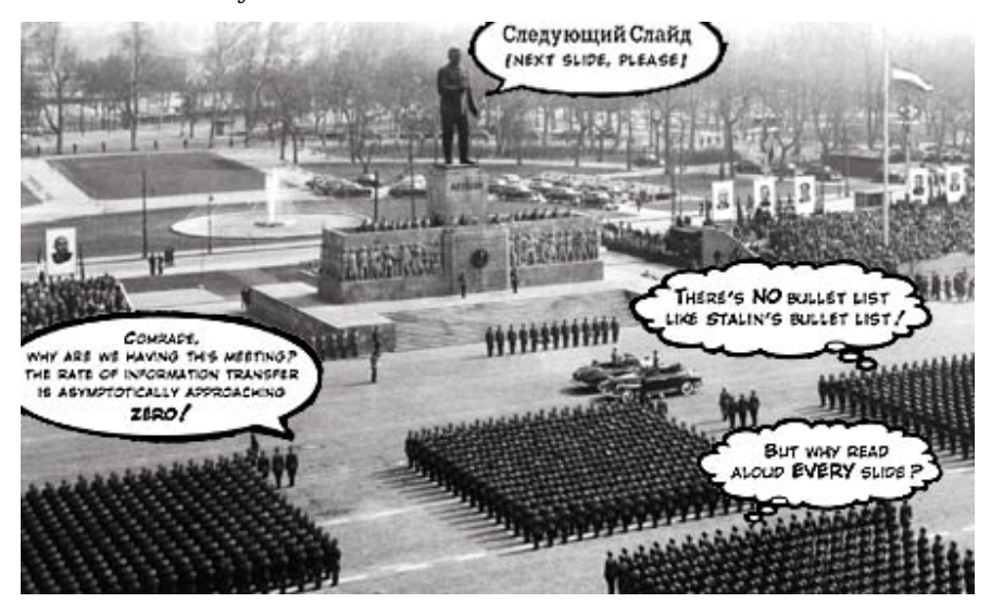
Tufte satirizes the totalitarian impact of presentation slideware.

Of course, data-driven meetings are nothing new. Years before today's slideware, presentations at companies such as IBM and in the military used bullet lists shown by overhead projectors. But the format has become ubiquitous under PowerPoint, which was created in 1984 and later acquired by Microsoft. PowerPoint's pushy style seeks to set up a speaker's dominance over the audience. The speaker, after all, is making power points with bullets to followers. Could any metaphor be worse? Voicemail menu systems? Billboards? Television? Stalin?