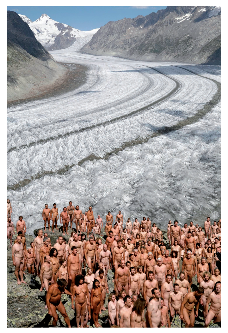
Figure 3. Greenpeace, Spencer Tunick, and 600 others protest global warming..