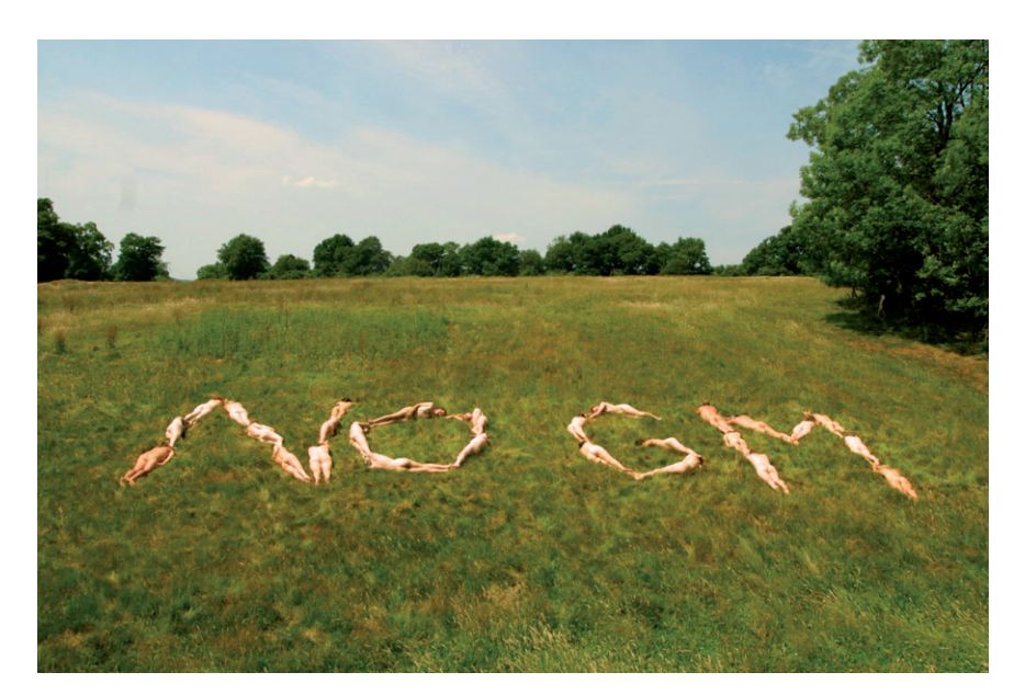
Figure 1. No GMO. (From Bare Witness n.d. d.).