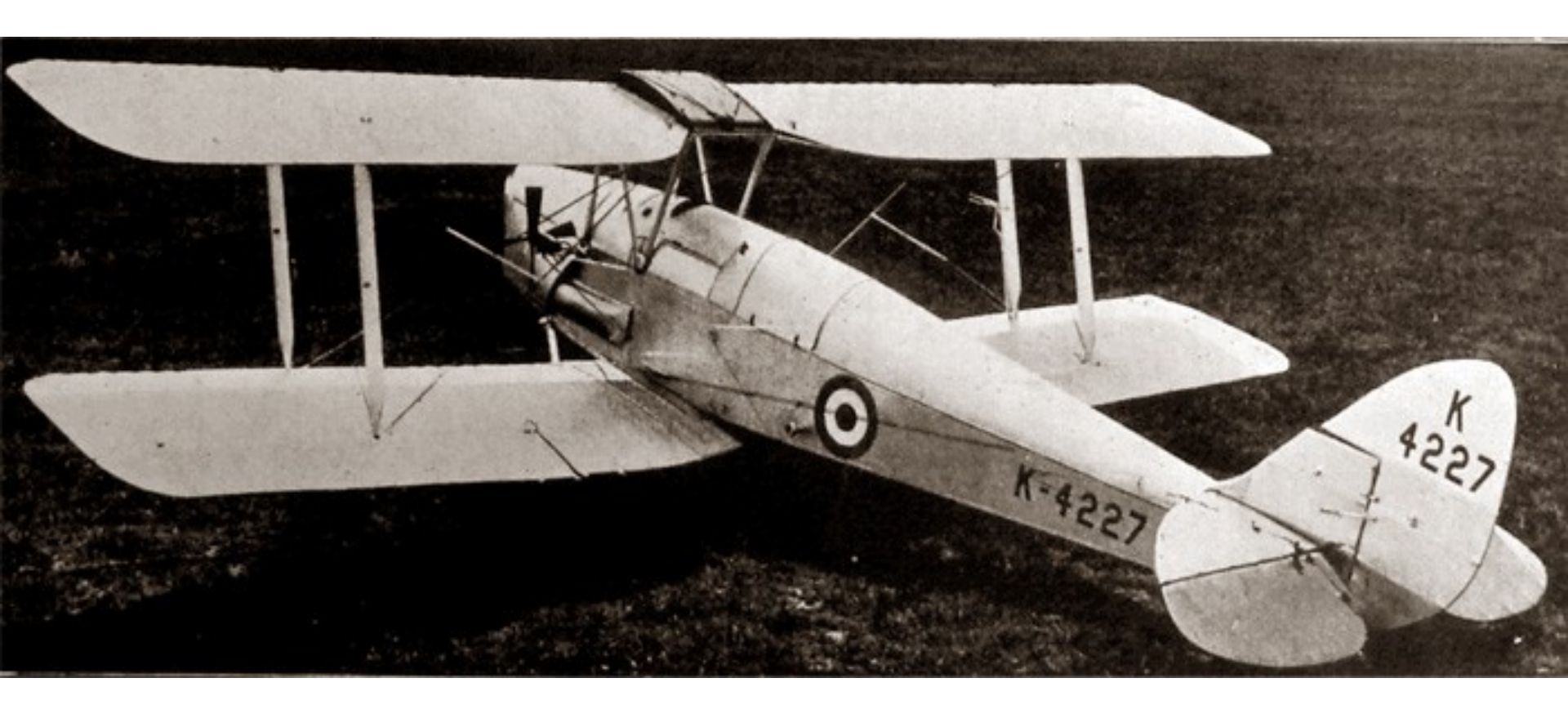
and <a href="https://www.youtube.com/watch?v=z1csDqNO8FY">https://www.youtube.com/watch?v=z1csDqNO8FY</a>