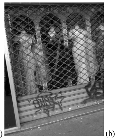
Figure 4. Clothing as a phatic signs of ethnic identity. (a) 'Asian Cloth House' on Tøyengata in Oslo. Photograph by Jerome Krase, 2010. (b) South Asian fashions for sale on Rue du Faubourg Saint Denis in Paris. Photograph by Timothy Shortell, 2010.

Figure 5 shows how food operates as a similar phatic sign. Food choices reflect cultural norms. The logic of commerce results in food shops stocking and advertising products that are in demand by the local community. Image (a) shows a Chinese market in Sunset Park, Brooklyn. The large Chinese community in the neighborhood shops in places like this. Others tend to see the display of these foods as evidence that Sunset Park is a Chinese neighborhood. In image (b), an Indian and Pakistani grocery functions in the same way. This shop, and the neighboring bakery, and others on the block, effectively designate this part of Coney Island Avenue as 'Little Pakistan' in Brooklyn.