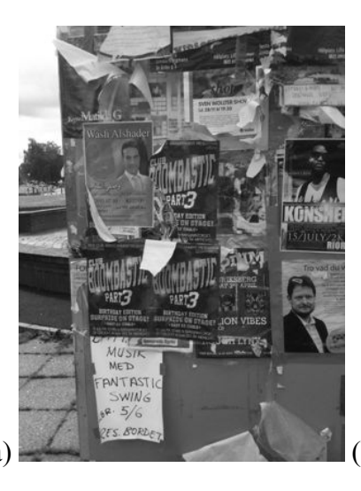
Figure 3. More phatic signs in the urban vernacular landscape. (a) Window advertising telecommunications services in Chinatown, Philadelphia. (b) Message board in a public plaza in Angered Centrum, an ethnic suburb of Gothenburg.

Cultural products like food and clothing also mark urban neighborhoods as belonging to certain groups. Figure 4 shows two examples of store windows that are visually very similar. In image (a), the window of the 'Asian Cloth House' in Olso advertises particular fashions. In image (b), the same can be seen in a window of a shop on Rue du Faubourg Saint Denis in the 10th arrondissement of Paris. The style of dress reflects a distinct cultural marker; although anyone is free to shop in these places, the presence of the window displays – as well as people wearing these fashions on the street – marks the territory as a 'South Asian neighborhood.'