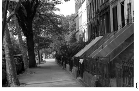
Figure 8. (a) St. Petersburg informal flower market. Photograph by Jerome Krase, 2008. (b) Block of brownstones in Prospect Heights, a rapidly gentrifying Brooklyn neighborhood. Photograph by Timothy Shortell, 2009.

Urban vernacular landscapes are filled with expressive as well as phatic signs of collective identity. Expressive signs are just as effective in marking urban social space as belonging to particular social groups. Figure 9 demonstrates how houses of worship function as expressive signs; these mosques signify not only the faith community, but also immigrant status. Image (a) shows the minaret of a mosque in Cape Town. The architecture is distinctive. In image (b), a storefront mosque uses the traditional colors of Islam, green and white, as well as the Arabic alphabet to announce itself. Both the signage and the function of the building are expressive signs. There are often worshippers outside, further marking the territory as home to the North African Muslims who live in the surrounding blocks.