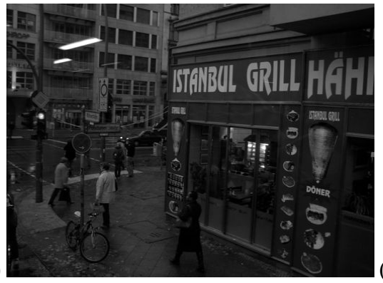
Figure 6. Restaurants also represent a phatic sign of ethnic identity. (a) "Little Aladdin' on High Street in Manchester. Photograph by Timothy Shortell, 2009. (b) 'Istanbul Grill' on Potsdamer straße in Berlin. Photograph by Jerome Krase, 2008.

Other features of public space can function as phatic signs, as shown in Figure 7. In image (a), a banner advertises the Manchester Art Gallery by showing a young Muslim woman looking at art. By targeting untypical English patrons, the banner normalizes the connection between the social space of Manchester and Muslim immigrants. In image (b), a salon on Boulevard Magenta in Paris is painted with a holiday theme. The black African woman wearing the Santa hat is a subtle sign that the neighborhood is multiracial. In fact, many of the shops on this stretch of the boulevard are patronized by Paris' large black population.