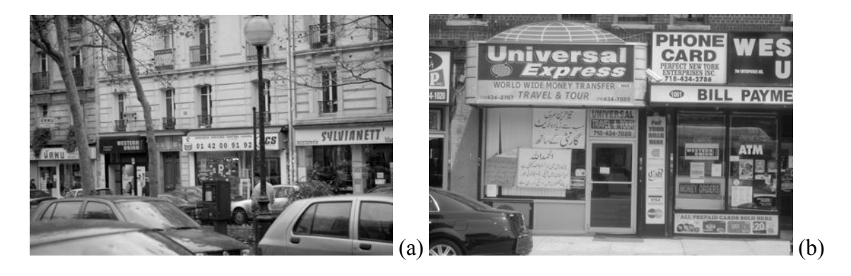
Figure 2. Phatic signs of identity in the built environment. (a) Common immigrant services in Belleville. (b) Common immigrant services in Brooklyn.

found on a commercial street in Belleville, Paris. This part of the neighborhood is panAsian, and the services reflect this. The CD and DVD store, at the far left of the photograph, sells entertainment and other specialty items from East Asia. In image (b), money transfer and travel services are offered. These businesses in the Pakistani neighborhood along Coney Island Avenue, in Brooklyn, also use alphabets on signage as an indicator of who lives here.