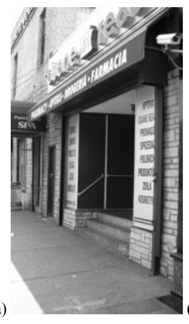
Figure 15. Conative signs of ethnic identity. (a) Chinese restaurant menus in Manchester. Photograph by Timothy Shortell, 2009. (b) Polish on the awning and fascia of a Duane Reade pharmacy in Greenpoint, Brooklyn. Photograph by Jerome Krase, 2010.

Aspects of the built environment can also function as a conative sign, as shown in Figure 16. The iconic marker of urban poverty in the global south, the shantytown, is