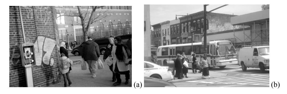
Figure 1. Phatic signs of collective identity in Brooklyn. (a) Muslim parents and children near a public school. (b) Orthodox Jewish women on a commercial street.

Figure 1 shows two views of streetscapes along Coney Island Avenue in Brooklyn. Image (a) shows parents and children near a public school. The style of dress – in particular, the head scarves – signal identity information about the people using this public space. In image (b), we see the same kind of phatic sign, though in this case the identity of the people in the image is different. In the first photograph, the people in the foreground are Muslim; in the second image, the crowd on the corner is Orthodox Jewish. Observers of the neighborhoods along Coney Island Avenue, whether they themselves are Muslim, Jewish, or something else, would be able to recognize the semiotic function of the style of dress (without being aware of it as a semiotic function), and in a sense, know to whom the neighborhood 'belongs.'