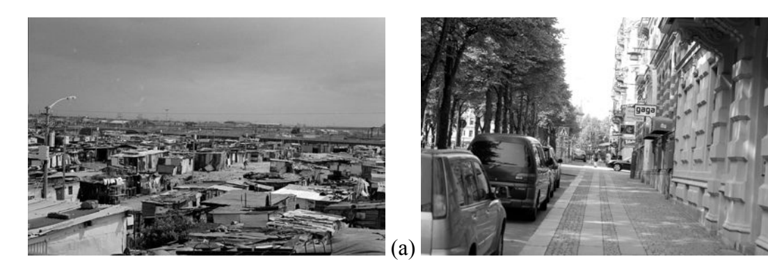
Figure 16. (a) Township outside of Cape Town. Photograph by Jerome Krase, 2000. (b)

usually interpreted to be a sign of danger to outsiders. In image (a), this township outside of Cape Town could almost stand for urban poverty throughout the developing world. As noted by Gehl (2010), South Africa has tried, with its 'dignified places programme' to create quality urban space for the poor to counter this prevalent symbol. In image (b), the effect is seen from the opposite end of the class hierarchy; this is a streetscape along Vasagaten in Gothenburg. Though not quite as well known as its more gentrified, and touristy, neighbor, the adjacent Haga neighborhood, this area is lined trendy restaurants and shops, basking in the status of Göteborgs Universitet . This is not a place for the faint of wallet.