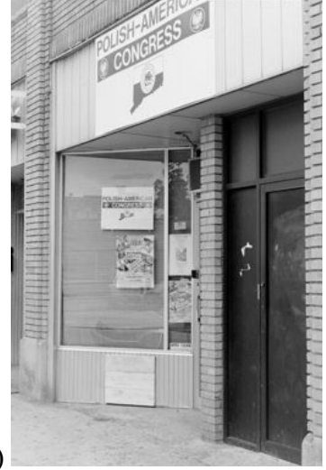
Figure 12. (a) Puerto Rican flag mural, Williamsburg, Brooklyn. Photograph by Jerome Krase, 2010. (b) 'Polish-American Congress' in New Britain, Connecticut. Photograph by Jerome Krase, 2000.