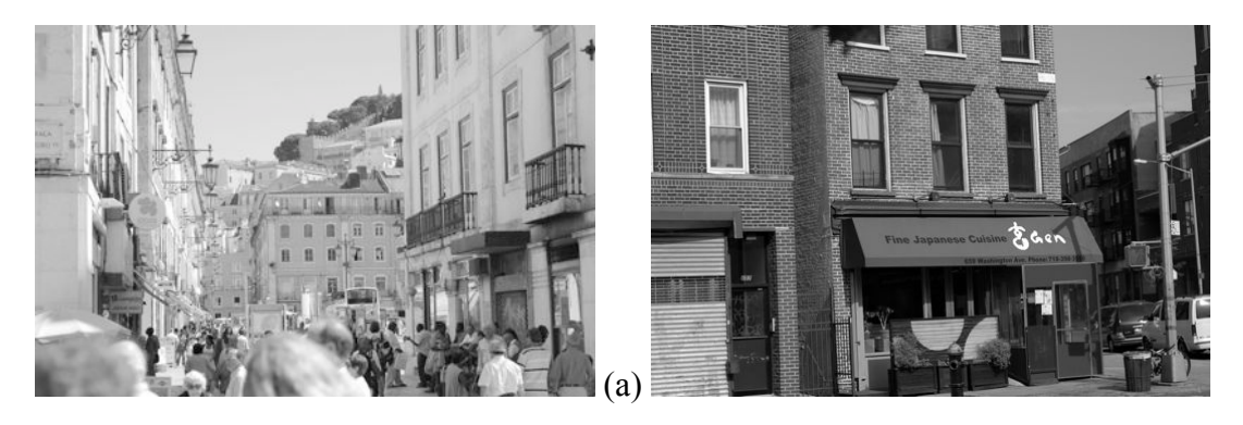
Figure 14. Expressive signs of class identity. (a) Shopping on Avenida da Liberdade, one of the most gentrified areas of Lisbon. Photograph by Timothy Shortell, 2009. (b) Upscale dining in an 'authentic' Japanese restaurant in Prospect Heights, Brooklyn. Photograph by Timothy Shortell, 2009.

Gentrification generates a plethora of expressive signs of class identity, as gentrifiers mark the territory as having acquired new status. All things upscale are signs of upper middle class status, including the 'ironic' use of working class features, such as business names and façades. Figure 14 shows two examples of these expressive signs of class. Image (a) shows a busy shopping block in the heart of Lisbon's gentrified downtown, Avenida da Liberdade. Here local Lisbon history, the site of the original market near the port, mixes with globalized luxury brands. Image (b) shows the façade of a upscale restaurant in Prospect Heights, Brooklyn, which promises 'fine Japanese cuisine.' Careful attention to the creation of upscale ambience is common sign of the gentrified business. The contrast with working class Caribbean restaurants a couple blocks away is striking.