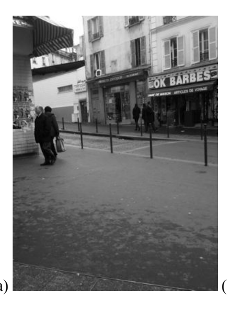
Figure 9. Places of worship are expressive signs of religious identity. (a) Minaret of a mosque in Cape Town. Photograph by Jerome Krase, 2000. (b) Storefront mosque in La Goutte d'Or, Paris. Photograph by Timothy Shortell, 2010.

As with phatic signs, both the built environment and the social activity that takes place within it have semiotic functions. Figure 10 shows two examples of collective action serving as an expressive sign of collective identity. Image (a) shows a prodemocracy protest in Piccadilly Gardens by Manchester's local Iranian community. The participants and the protest signs and flags they carried were clearly expressing a connection to Iran, temporarily marking the park as their space. Image (b) shows a march for the rights of 'undocumented persons' in Paris. The march appeared to be headed toward Place de la République, a traditional space for populist collective action. The photograph shows the march turning onto Boulevard de la Chapelle from La Goutte d'Or, a neighborhood of North African and West African immigrants.