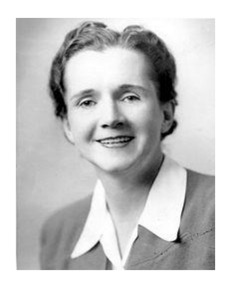
Rachel Carson, 1940

We all indvidually might experience economical benefit from certain environmental damaging practices. The examples are numerous. Cleaning paintbrushes after painting a house produce harmful wastematerial that should be disposed in certain ways. Batteries should be treated as dangerous wastematerial. Still, in both cases we will be able to avoid the extra work without anyone noticing our harmful practices. We save time and sometimes even money polluting the environment. At times we make beautiful gardens without weeding wikt ba little chemistry helping us