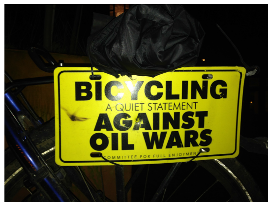
Fig. 3. A statement about mobility and oil wars, Toronto, Canada, 2009.

Different groups may also have contested views of a particular frame. If employees frame automobiles as mobile digital offices, so too may their employers—but to different ends. The employee may be thinking how to use travel time to accomplish work functions so they can spend less real time “at work”. The employer’s interpretation of mobile digital offices may be for work to colonize the automobile, making the employee’s availability ubiquitous, extending spatially outside the workplace and temporally outside of normal office hours. Cocooning as a private-functional search for safety can lead to a social-functional arms race in which drivers seek larger, heavier cars to make them “safe” but only at the expense of others. But, in shaping cars to be bigger and safer, the dangers of vehicles have been significantly externalized unto non-drivers, including cyclists, pedestrians, and especially children (Desapriya et al., 2010). Thus, even single frames may provoke contested reactions. Such tensions between the broader versus individualized