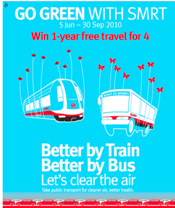
Fig. 2. (continued)

new products, and the latter can also impact expression of class and wealth. As another example, cocooning and fortressing along with mobile digital offices can impact suburbanizing, and vice versa.