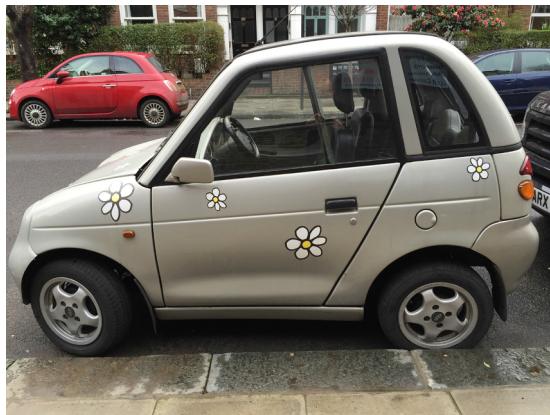
Fig. 1. An electric vehicle “Feminized” with flowers in London, United Kingdom, 2016.

Second, cars can also reflect symbols of class and luxury (Walker et al., 2000) or as a “status symbol” (Steg, 2005). Indeed, the development of automobility is described as being driven by the upper class from its early days, where passenger vehicles were