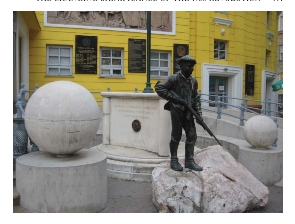
FIGURE 4. THE STATUE OF THE 'PEST LAD' IN FRONT OF THE CORVIN CINEMA.

Minister Lajos Bokros), <sup>26</sup> a revitalised right led by Fidesz was voted into power in 1998. Fidesz 's embrace of 1956 was not immediate, however. As Litván observed, in the autumn of 1998—the first time they were in power for the anniversary—Prime Minister Viktor Orbán's speech was politically neutral (Litván 2002, p. 263). The situation changed a year later when the 1956 Institute saw 90% of its funding cut in favour of the new 20th Century Institute, which was led by Mária Schmidt, a close adviser to the prime minister (Nyyssönen 1999, p. 277). (Three years later Schmidt would become the director of the House of Terror museum when it opened its doors.) The 20th Century Institute espoused an interpretation of the recent past more aligned with Fidesz 's views than the 1956 Institute or the Political History Institute, the latter two of which have been more favourably looked upon by the Socialist–Free Democrat coalition governments.