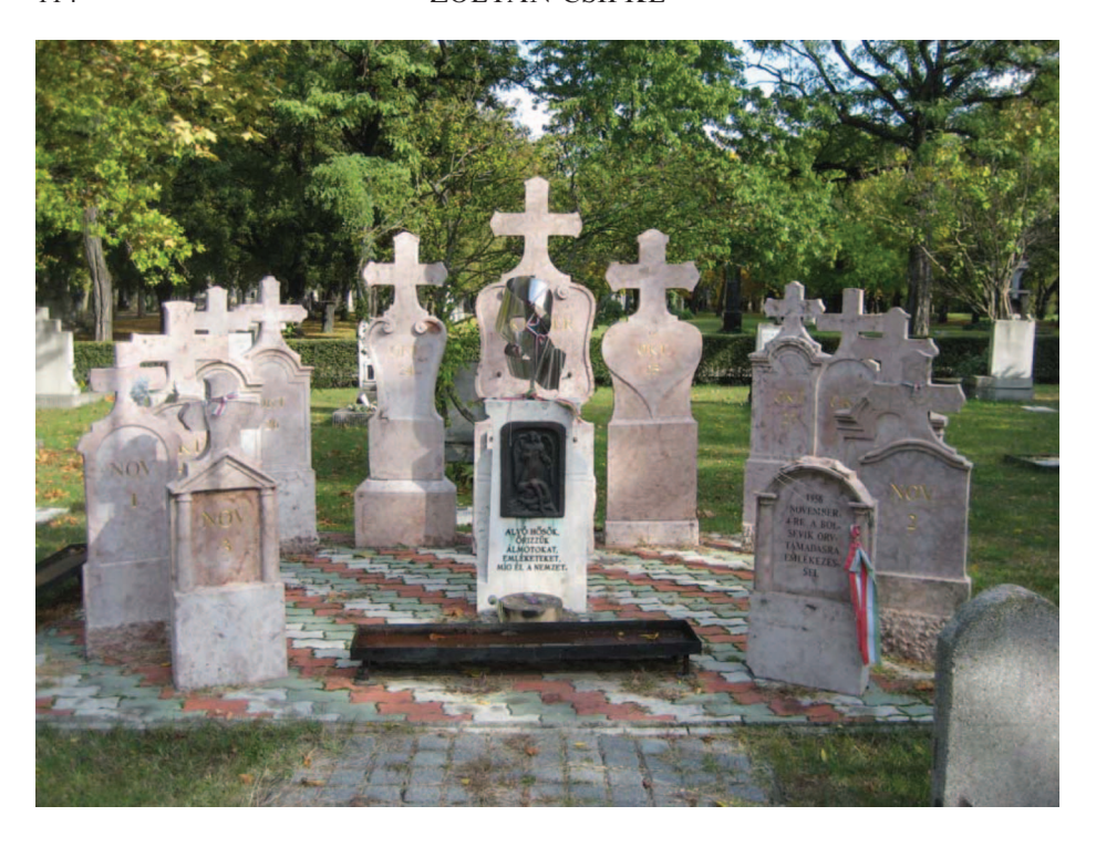
FIGURE 7. THE SYMBOLIC MEMORIAL THAT CAN BE FOUND IN LOT 21 OF THE KEREPESI CEMETERY.

Figure 8). Another example of how the significance of 1956 changed was the addition of a wall memorial to 1956 by the Democratic Forum at Móricz Zsigmond Circus in 2001, despite the party already erecting a tablet on the site in 1989. Above the marble plaque of the new memorial is a bronze figure of a woman reaching for the sky, or perhaps the bottom of a flag, symbolising the quest for freedom. Not only is this later memorial more visually striking, but it adds the word 'heroic', which the memorial from 1989 did not feature. The addition of this memorial suggests that the original was deemed insufficient, perhaps due to the party's changing stance, or the changing nature of commemoration.