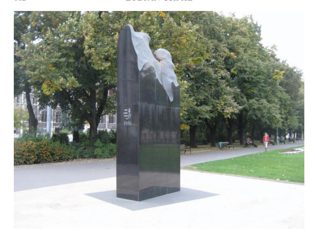
FIGURE 5. THE 'FLAME OF THE REVOLUTION' GRANITE CANDLE MEMORIAL LOCATED IN FRONT OF THE PARLIAMENT BUILDING.

mentioned earlier, it was the working class that played the largest role in 1956). Gyáni continued: