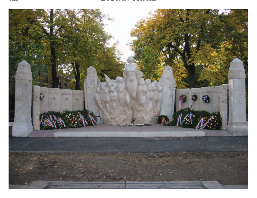
FIGURE 9. One of Two Official Memorials Dedicated for the 50th Anniversary. It was Sculpted by Róbert Csíkszentmihályi and is Located on the Site of a Disused Gate at the Technical University Facing Towards the Danube.

Fidesz, while calling for the government's resignation during their celebration, announced a political programme to collect signatures to launch a referendum on the government's announced austerity programme. At the end of this rally the riot police did not take measures to keep the far-right protestors separate from people wishing to make their way home, with the end result that in addition to the rioters, many innocent bystanders found themselves under attack by the police. Later in the evening, while Prime Minister Gyurcsány took part in the dedication of the new memorial on the former site of the Stalin statue, with occasional interruptions by a small crowd of protestors, teargas spread around central Budapest as the police and