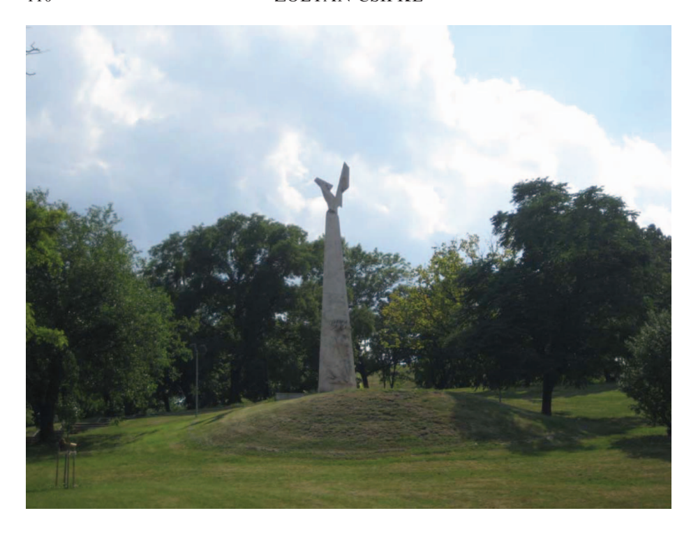
FIGURE 3. THE MEMORIAL COLUMN IN THE TABÁN AREA OF BUDAPEST'S DISTRICT I.

(Boros 1997, pp. 123–26). Thus the statue is further evidence of the fragmented nature of memory over 1956.