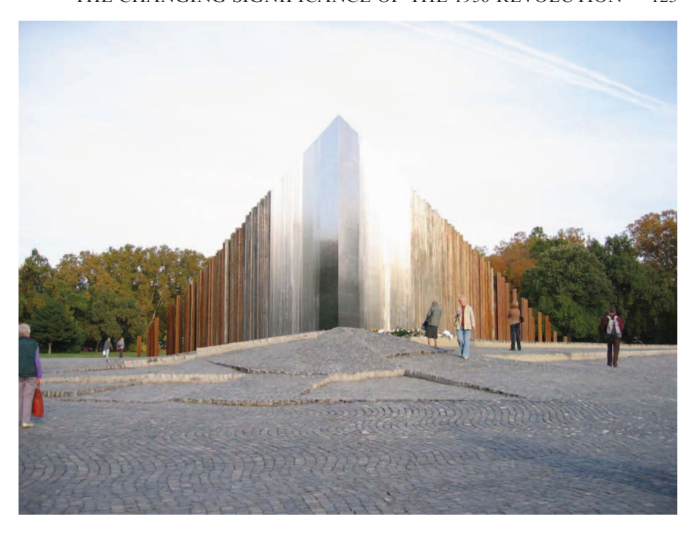
FIGURE 10. THE OTHER OFFICIAL MEMORIAL DEDICATED FOR THE 50TH ANNIVERSARY, DESIGNED BY THE I-YPSZILON GROUP. IT IS LOCATED AT WHAT IS TODAY KNOWN AS ÖTVENHATOSOK ("'56ERS') SQUARE.

rioters continued a pitched battle into the early hours of 24 October. On the 50th anniversary, Budapest witnessed the largest disturbances since the revolution itself.<sup>49</sup> 1956 was certainly central to the political discourse once more, but in many ways, contemporary politics had hijacked its memory.