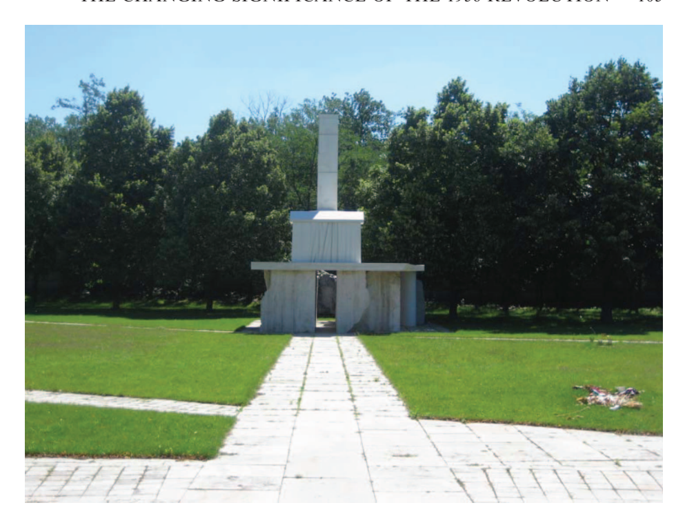
FIGURE 1. THE ABSTRACT MEMORIAL LOCATED IN LOT 300 OF THE RÁKOSKERESZTÚRI CEMETERY.

(Benziger 2008, p. 118). <sup>15</sup> Consequently, Nagy was distanced from the revolution in which he played a significant leadership role.