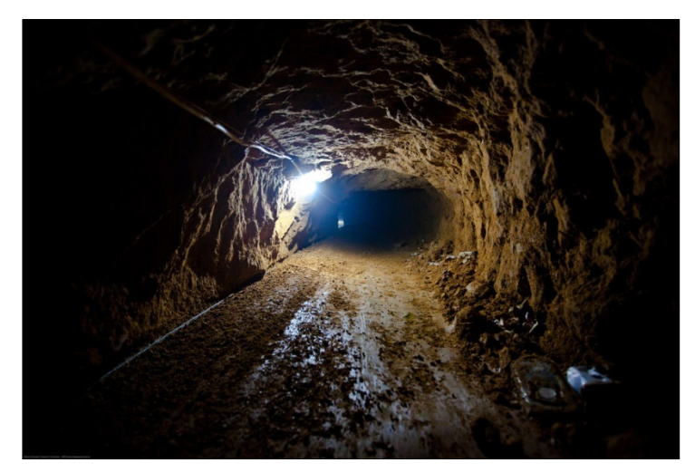
Smuggling tunnel in Rafah. Following the withdrawal of Israeli forces from the Philadelphi patrol route along the Gaza Strip's border with Egypt, Hamas embarked on a massive buildup of its terror infrastructure. By 2008, Hamas was launching ten rockets, missiles, and mortar shells into Israel a day.

In an attempt to stem this relentless harassment of its civilian population, in 2008-January 2009. Israel December launched a large ground operation in Gaza (codenamed Cast Lead). But while the operation eroded Hamas's military capabilities and led to a vast decrease in the firing of rockets and missiles,<sup>30</sup> it failed to curb the organization's military might and political ambitions. In the ensuing five years, Israel was forced to fight two more inconclusive wars against the Islamist group-Operation Pillar of Defense (November 14-21, 2012) and Operation Protective Edge (July 8-August 26, 2014). And to add insult to injury, it was Israel, rather than Hamas, that came under scathing international censure for its supposed use of "disproportionate force," including two major U.N. fact-finding reports and a string of indictments by humanitarian