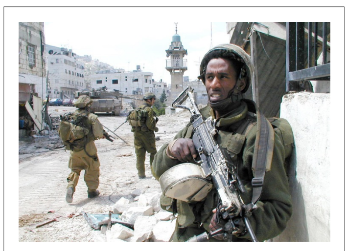
Israeli soldiers patrol Nablus during Operation Defensive Shield. Following the signing of the Oslo accords, the Palestinians have engaged Israel in a near constant state of war and terror, including hundreds of terror attacks in Israeli cities, a full-fledged terror war (the "al-Aqsa intifada"), and three protracted large scale military encounters between Hamas and Israel.

But then, instead of seizing the moment and opting for the obvious peace partner that was far better attuned to the needs and wishes of the local Palestinian populace, and against his personal inclination to strike a deal with the "moderate insiders" rather than the "extremist Tunis people [i.e., PLO leadership]," Rabin was persuaded by Foreign Minister Shimon Peres and his deputy Yossi Beilin (who reportedly collaborated with the PLO in obstructing the Washington talks) into surrendering the West Bankers and Gazans to an unreconstructed terror organization whose leader would not hang up his ubiquitous battledress, not even for the signing ceremonies of the various Oslo accords or the receipt of the Nobel Peace Prize, and who used peace as a