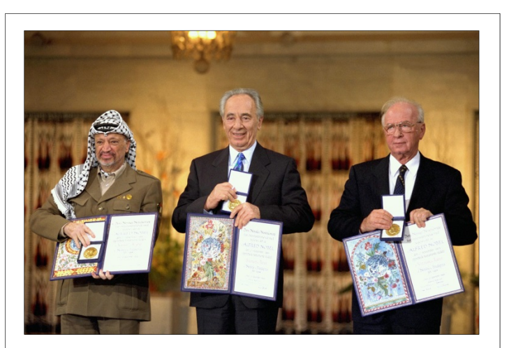
In 1994, (left to right) PLO chairman Yasser Arafat, Israeli prime minister Yitzhak Rabin, and foreign minister Shimon Peres received the Nobel Peace Prize following the signing of the 1993 Oslo accords. But twenty-three years later, peace is still illusive. For Israel, the accords have been the starkest strategic blunder, establishing an ineradicable terror entity on its doorstep, deepening its internal cleavages, and weakening its international standing.

"We make peace with enemies," Prime Minister Yitzhak Rabin reassured a concerned citizen shortly after the September 13, 1993 conclusion of the Israel-PLO