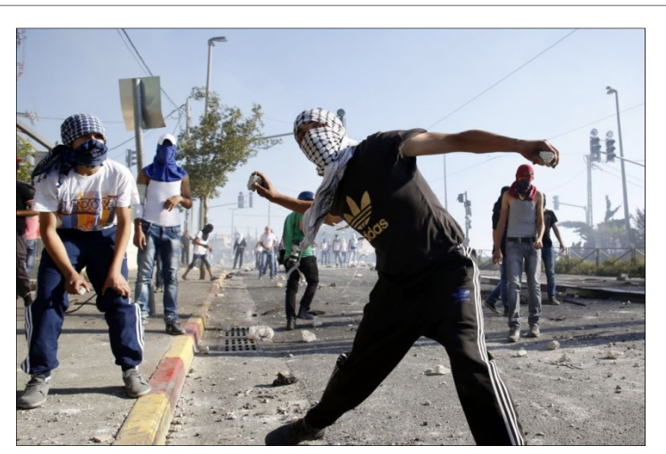
Decades of incitement and radicalization following Oslo have had a palpable effect on Arab-Jewish relations in Israel. Arab Israeli leaders have openly identified with Israel's sworn enemies, and Israeli Arabs have rioted often in reaction to Israeli attempts to stop Palestinian terrorism.

As the PLO seized its newly-gained opportunity with alacrity, open identification of Israeli Arab leaders with the country's sworn enemies became commonplace with many visiting the neighboring Arab states—from Syria, to Lebanon, to Libya, to Yemen—to confer with various heads of the "resistance