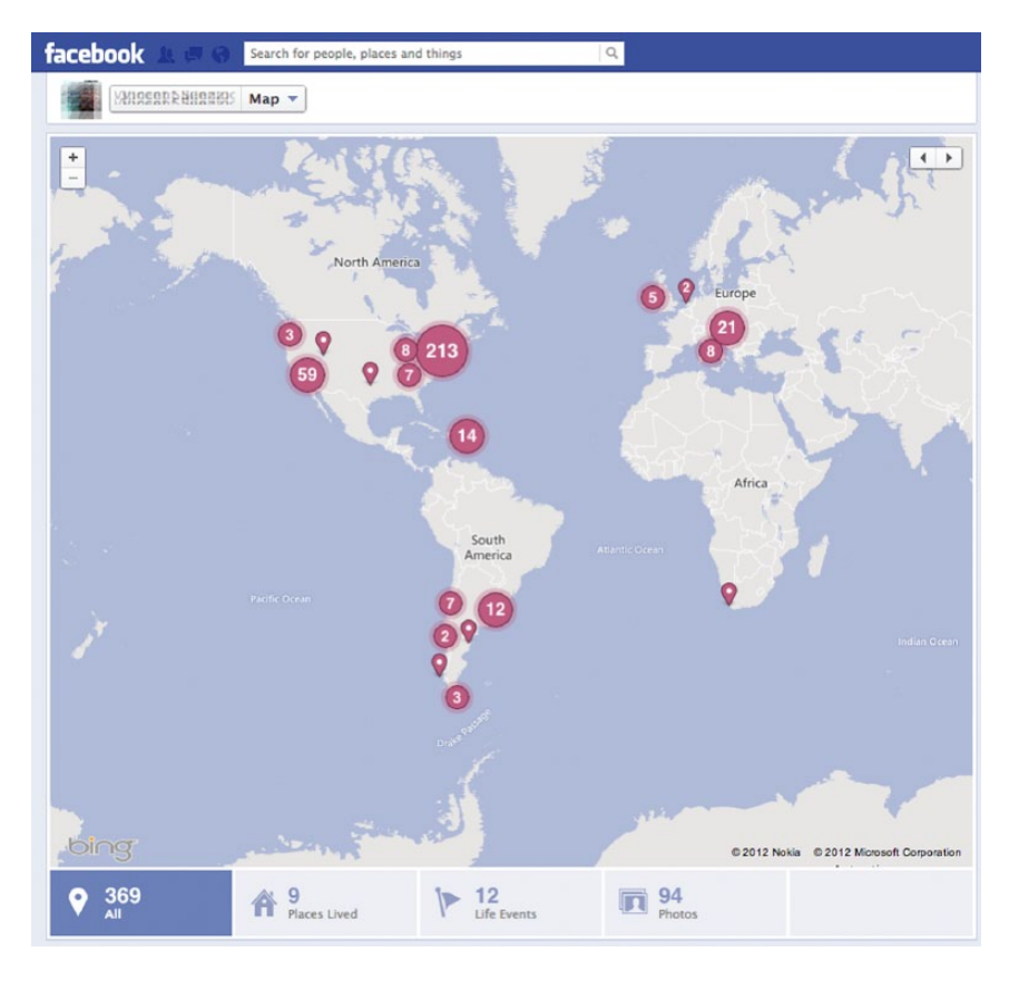
Figure 1. A user profile map on Facebook.

to address motivations for using the Facebook check-in function or identify how locationannouncement via mixed use social media platforms is read and understood by participants and audiences.