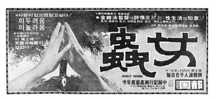
Insect Woman (1972)

the second phase of the industrial recovery saw the entry of new investors in the form of venture capitalists (Ilshin Investment Company, Kookmin and Mirae Venture Capital). The process of conglomeration and financial sup-