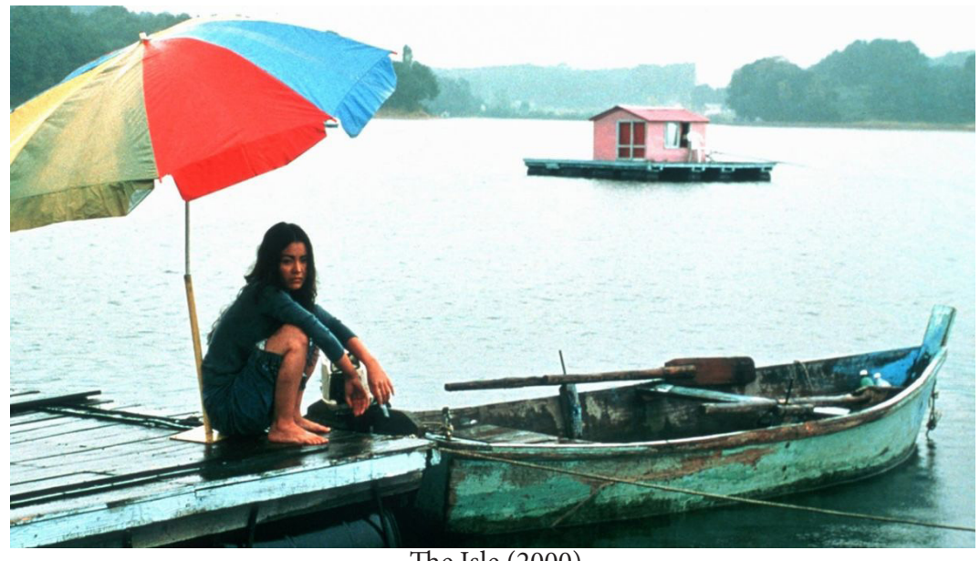
The Isle (2000)

it to the 91st Academy Awards' final nine-film shortlist for Best Foreign Language Film. Burning also won the Fipresci International Critics' Prize at the 71st Cannes Film Festival, Best Foreign Language Film in Los Angeles Film Critics Association, and Best Foreign Language Film in Toronto Film Critics Association. The polarizing and idiosyncratic films of Kim Ki-duk won numerous accolades, namely, the Golden Lion at 69th Venice International Film Festival for Pietà (2012), the Silver Lion for Best Director at 61st Venice International Film Festival for Empty Houses/3-Iron (2004), the Silver Bear for Best Director at 54th Berlin International Film Fes-