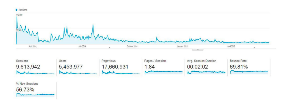
FIGURE 1 Daily numbers of sessions from early 2014 to mid-2015, as charted by Google Analytics

As its work practices developed, editors increasingly identified stories by systematic media monitoring rather than relying on submissions from the website. Russian media sources routinely monitored by StopFake included NTV (HTB), Вести (Vesti), РИА Новости (RIA News), Русская Весна (Russian Spring), Новороссия (Novorossiya), Антифашист (Antifascist), Украина.Ру (Ukraina.ru), and Звезда (Zvezda). The team also monitored