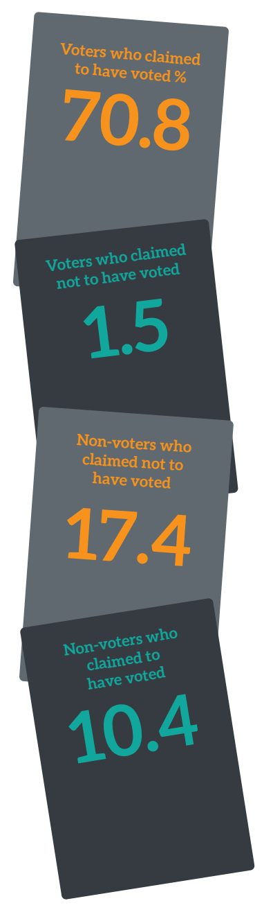
Figure 1: The Relationship between Actual Voting and Self-Reported Voting in 2010