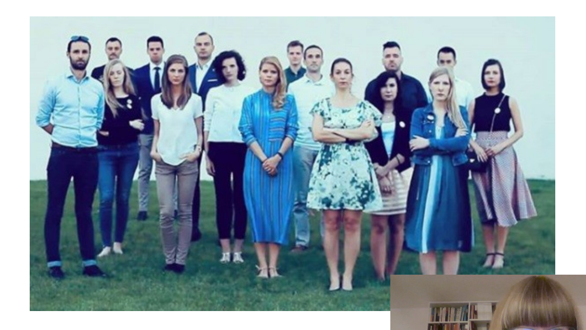
E.g., in May 2018, 12 journalists