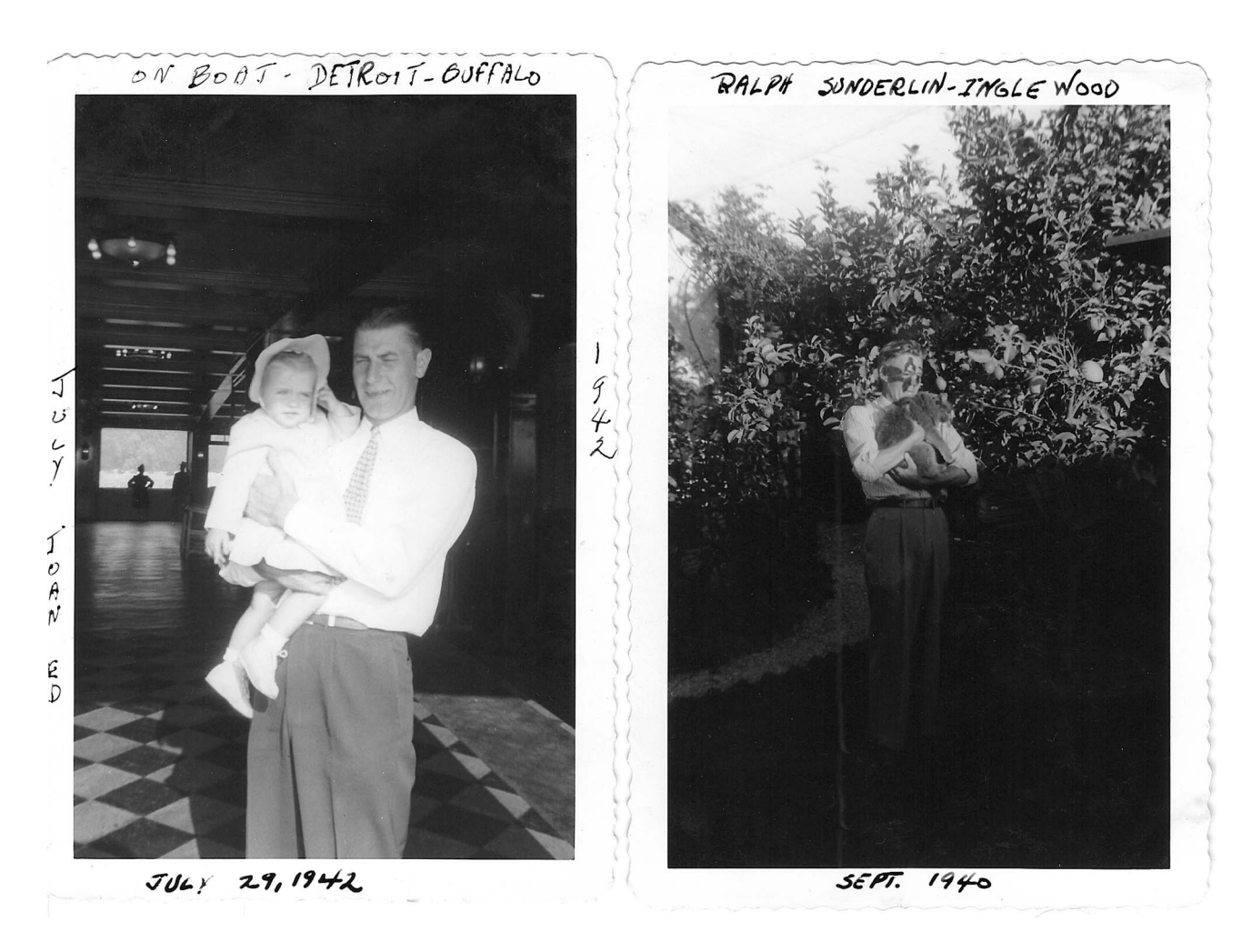
FIGURE 1. Old photographs found at a flea market: annotations on front of photographs

users, only the most skilled and dedicated photographers used software like Photoshop® Lightroom® to organise their images.