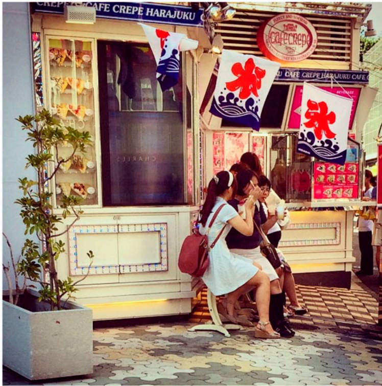
FIGURE 6 Citizen shot (Instagram effect: Valencia).

conventions of authenticity discussed earlier. Finally, the conventional use of axiomatic compositional rules by both collectives when framing their images also plays a fundamental role in counterbalancing the overreliance on filters and post-processing effects.