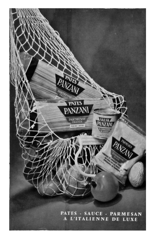
Figure 1. Panzani pasta advertisement

emphasis being placed on "the freshness of the products" and "the essentially domestic preparation for which they are destined" (Barthes 1977: 34). There is, then, a sign — "shopping bag" — in which the signifier is the image of the bag and the signified is the concept of /bag/. As a whole, this in turn becomes the signifier of a connotation whose signified is the concept of /home cooking/. There is also a second sign, where the signifier is the tomato, the pepper, and the tri-colored hues, and the signified, also connotative, is /Italianicity/. This is redundant with regard to the connotated sign of the linguistic message. Nestled in the image are a number of further signs the deciphering of which requires cultural knowledge; for instance, the arrangement of the ingredients points to an aesthetic signified in that it evokes a whole series of pictorial still lifes .