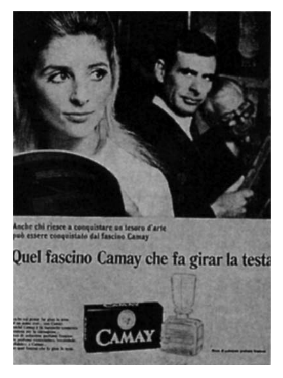
Figure 2. Advertisement for Camay soap

In order to answer these questions, Eco analyzes a number of adverts, noting above all that advertising codes function according to a dual register, verbal and visual. However, their relationship is more complex than the one envisaged by Barthes; according to Eco, it cannot be assumed that the anchorage is always provided by the verbal element. Sometimes this function is performed by the visual component with the aid of various rhetorical devices. He illustrates this idea by analyzing a well-known advertisement for Camay soap. The visual register is as follows: