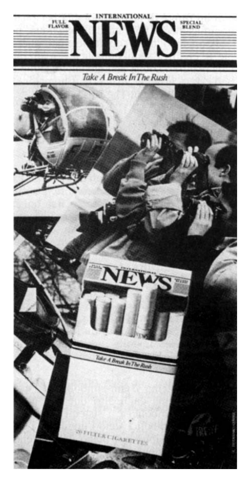
Figure 3. Advertisement for News cigarettes (1980)

irregular and polychromatic organization, while that of the cigarette packet is regular and monochromatic). All the graphic and chromatic oppositions that Floch succeeds in finding (for example, between parallelisms and irregular grids, symmetries and asymmetries, pure colors and shades, the polychromatic and the monochromatic) can be traced back to the same category on the plane of expression: continuity versus discontinuity . Floch then moves on to explore the content plane of the advert as a whole, which is presented, complete with title and masthead, as the "front page" of a daily newspaper. So what exactly does the notion of /front page/ refer to? It is where the day's most important news items, the most illuminating or exciting stories, are presented. It also