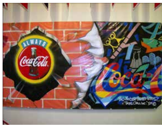
Figures 3 and 4. Tats Cru pieces for Coke. Courtesy of Tats Cru. Color figures available online.

[Metropolitan Transportation Authority] had built a $25 million car wash that smeared and faded (but could not remove) the masterpieces on the trains and had formed an antigraffiti police squad." As a new wave of creativity bloomed in 1977, the MTA introduced polyurethane paint coverings, an automatic chemical wash known as "the Buff," and an enforcement unit known as the Vandal Squad. While measures were being taken to eradicate graffiti in America.