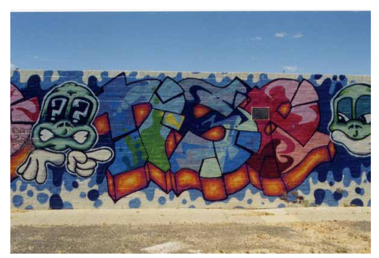
Figure 1. Piece. Color figure available online.