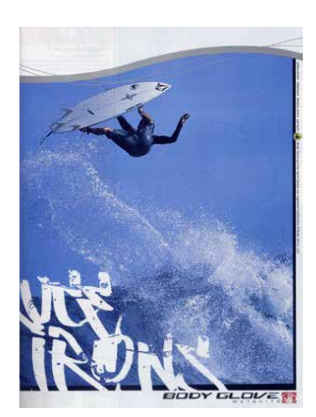
Figure 7. A Body Glove advertisement utilizes tagging style. Advertisement courtesy of Body Glove. Color figure available online.

of sociological attention." The commercial incorporation of graffiti is not quite as simple as Florida would have us believe. The proliferation of legal opportunities has meant changes to graffiti culture. For instance, following the success artists such as Shepard Fairey and Banksy, graffiti writers command a notoriety that extends well beyond the subculture, challenging assumptions that graffiti is fueled largely by subcultural recognition. Recontextualized onto product labels, on clothing, and into advertising changes graffiti, thus legal graffiti is not only displaced from its location but also from another important aspect of the graffiti aesthetic: its mode of production. As Banksy (2005, p. 205) articulates, "The craft is finding a decent drainpipe to get access to the site as much as it is in the art. . . . Van Gogh used short, stumpy brush strokes to convey his insanity—I use short, thin ledges above mainline train tracks."