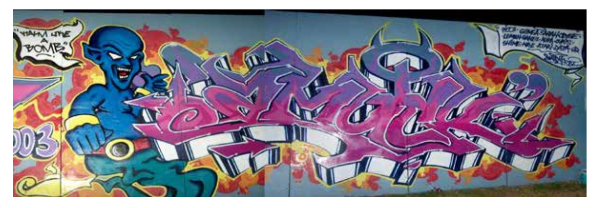
Figure 8. Amuck legal piece. Color figure available online.