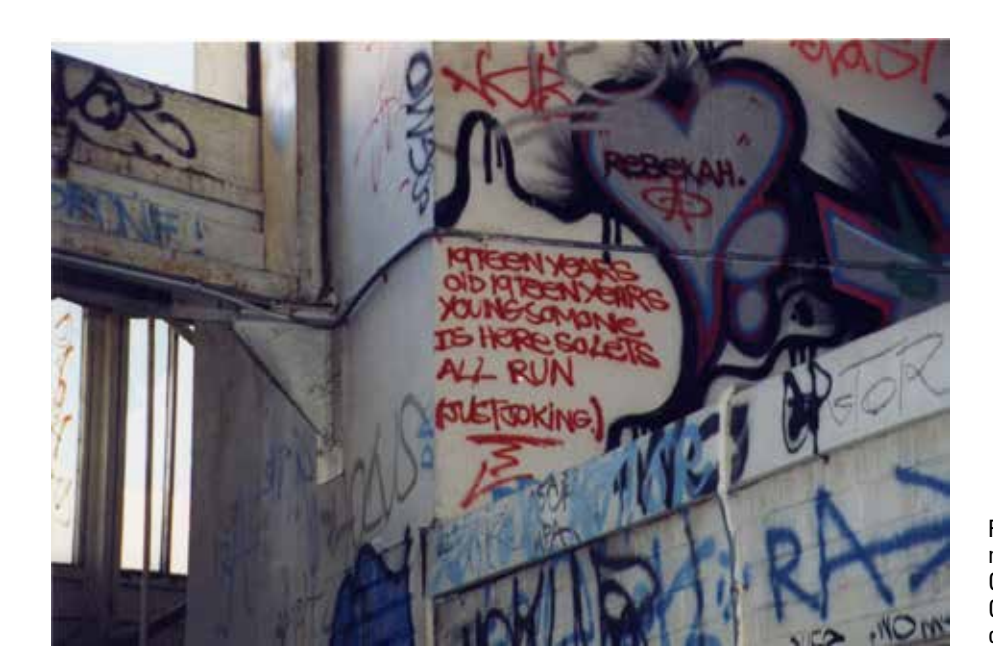
Figure 5. Amuck hears noises while painting. Color figure available online.