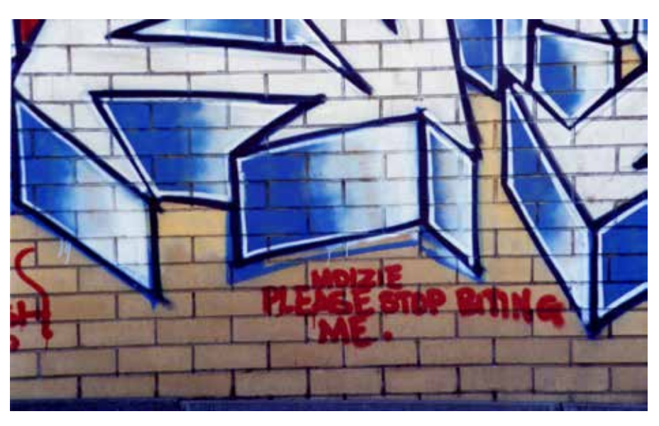
Figure 6. Moizie please stop biting me. Color figure available online.

industries" is an idea whose time has come; it "suits the political, cultural and technological landscape of these times," and it is a concept that combines and radically transforms the two existing terms of creative arts and cultural industries to produce the creative industries (p. 2). Creative industries is a reaction to the former polarized opposition of commerce and creativity. To understand why the creative industries concept is seen as so radical, it must be noted that civic humanism and cultural conservatives such as Geoffrey Faber, F. R. Leavis, and Queenie Leavis have left a lasting impact, which has resulted in an opposition between culture or creativity and commerce. To develop an account of the rise of