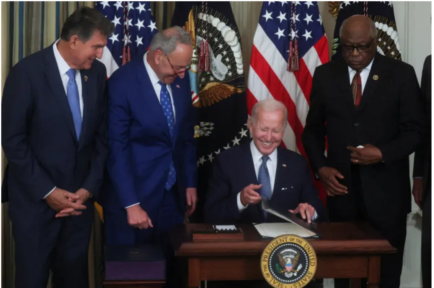
U.S. President Joe Biden signs the Inflation Reduction Act into law, Washington, D.C., August 2022

By John M. Deutch and Ernest J. Moniz September 7, 2022