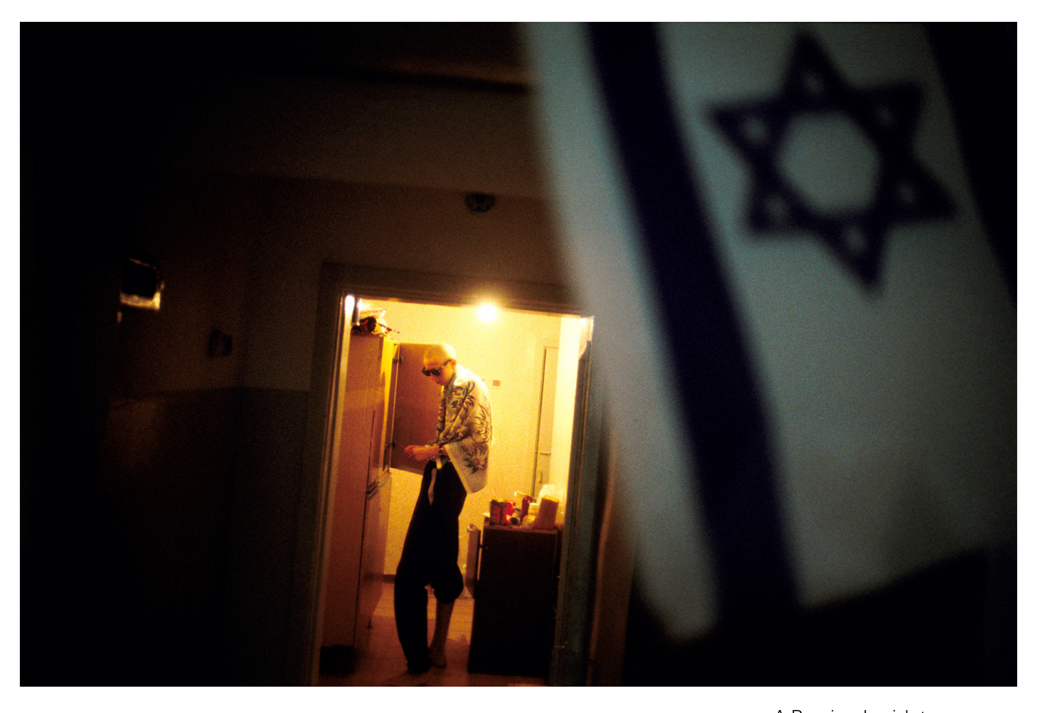
A Russian Jewish teenager at an Israel-sponsored summer camp. Birobidzhan, Jewish Autonomous Region. Russia. 1999.

Bendiksen planned to spend a year in the region, looking to document the daily life of the remaining Jewish community that resides there, and searching for signs of the region's Soviet history. However, within ten months the photographer faced accusations of espionage from the Federal Security Service (FSB), the chief security agency of Russia, and the main successor to the Soviet Union's KGB. Fortunately, Bendiksen had become good friends with some locals who happened to have connections with the FSB agents, so rather than be deported, he agreed to board the next train out of town of his own accord. Swiftly gathering all his belongings, including his many rolls of undeveloped film, the photographer left Birobidzhan.