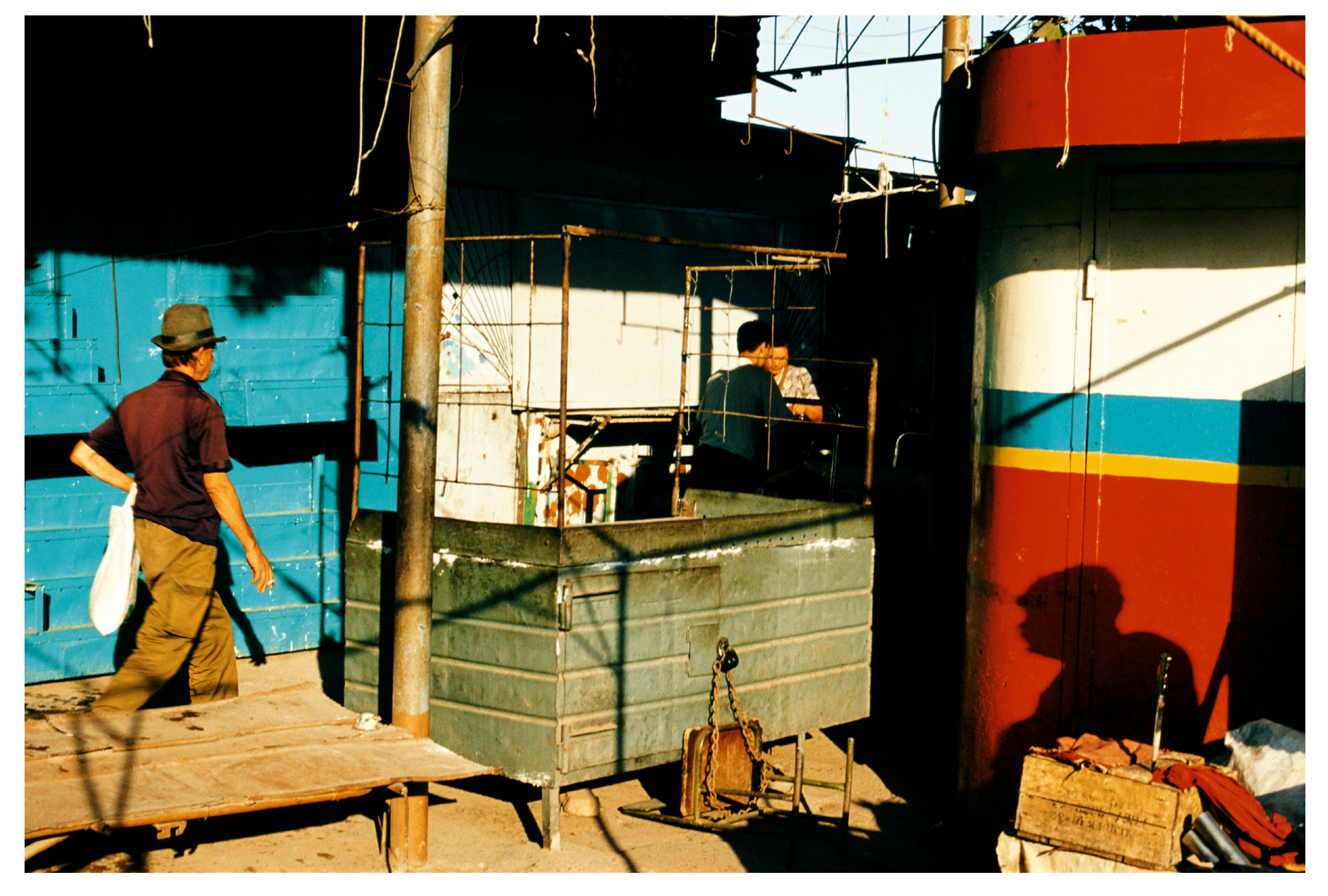
Marketplace. Osh. Ferghana Valley. Kyrgyzstan. 2002.