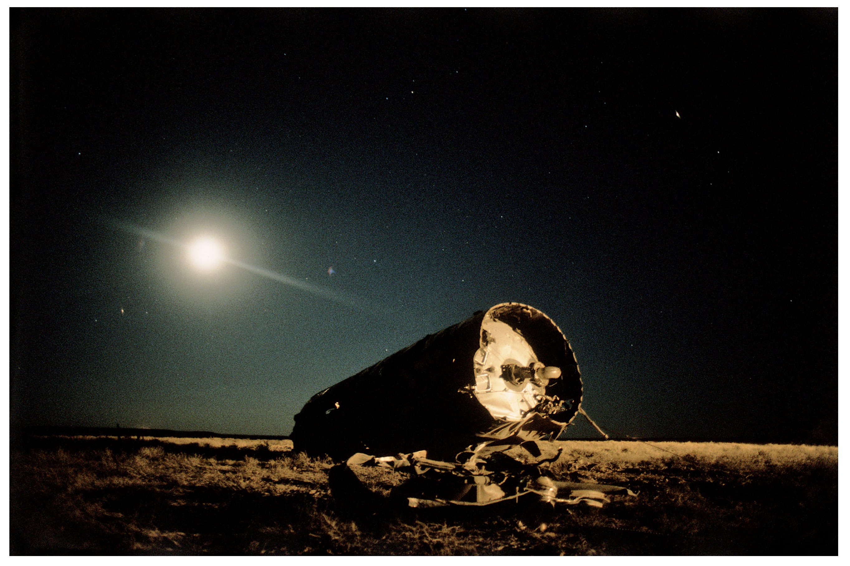
A Soyuz rocket fuel tank lies on the steppe. Kazakhstan. 2000.