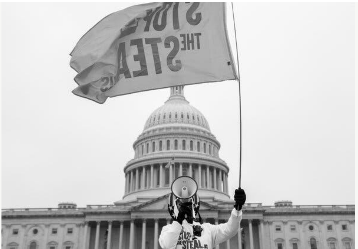
A Stop the Steal protester outside the Capitol in January. Facebook enacted security and safety measures ahead of the election.

On Nov. 5, one Facebook employee posted a message to an internal online group called “News Feed Feedback.” In his note, he told colleagues that voting misinformation was conspicuous in the comments section of posts. Even worse, the employee said, comments with the most incendiary election misinformation were being amplified to appear at the top of comment threads, spreading inaccurate information.