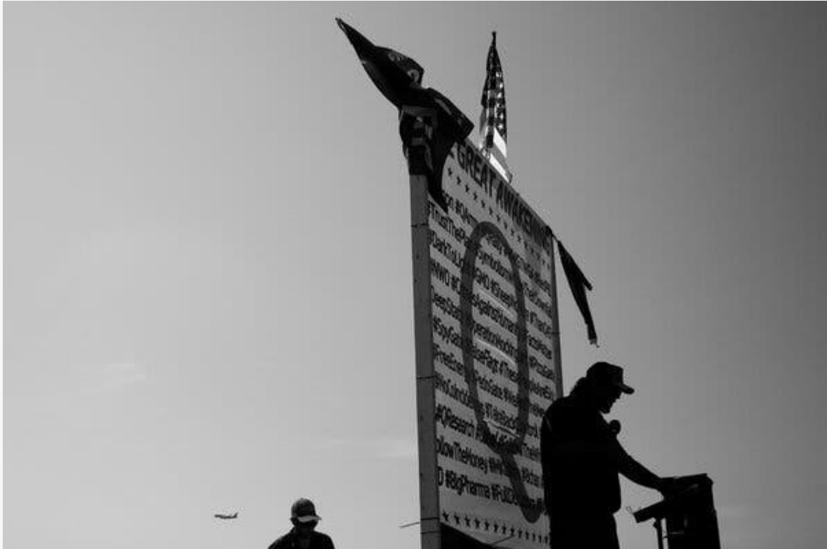
A rally in Washington in 2019 for QAnon, the conspiracy theory movement. Facebook's researchers identified in 2019 that content on the movement was problematic.

Ms. Haugen's documents, some of which The Wall Street Journal has published, have created an outcry among lawmakers and regulators, plunging Facebook into one of its worst public relations crises in years. The disclosures from Ms. Haugen, who plans to appear at a hearing in Britain's Parliament on Monday, have resurfaced questions about what role Facebook played in the events leading up to the Jan. 6 Capitol riot.