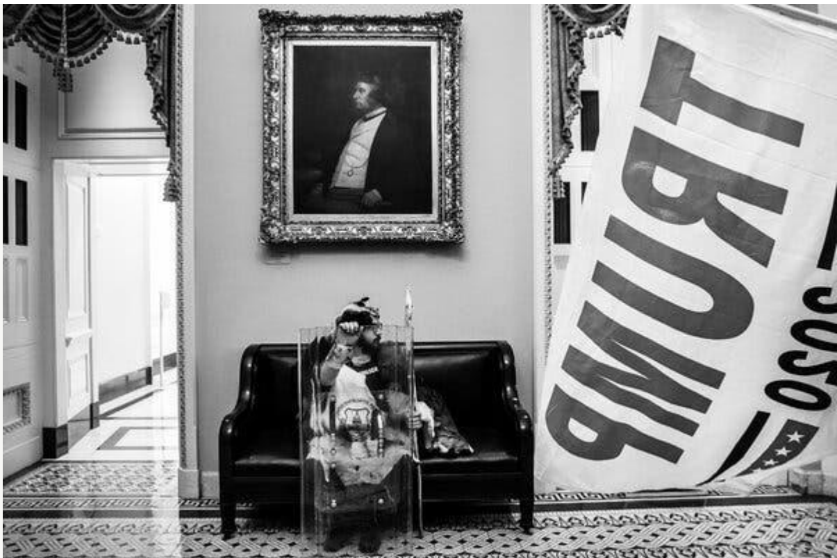
A rioter outside the Senate chamber in the Capitol on Jan. 6. Employees kept a running tally of measures that Facebook deployed that day to prevent calls for violence.