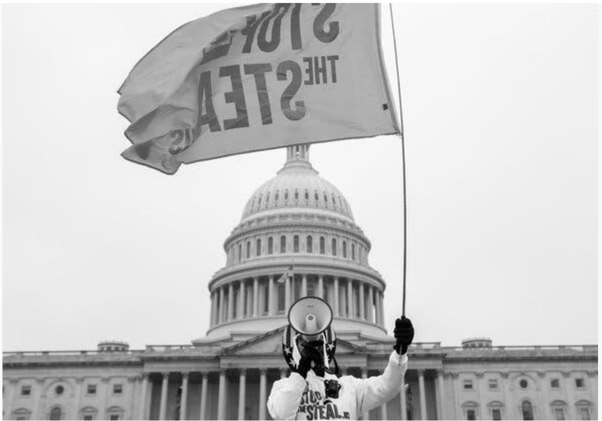
A Stop the Steal protester outside the Capitol in January. Facebook enacted security and safety measures ahead of the election.

On Nov. 5, one Facebook employee posted a message to an internal online group called "News Feed Feedback." In his note, he told colleagues that voting misinformation was conspicuous in the comments section of posts. Even worse, the employee said, comments with the most incendiary election misinformation were being amplified to appear at the top of comment threads, spreading inaccurate information.