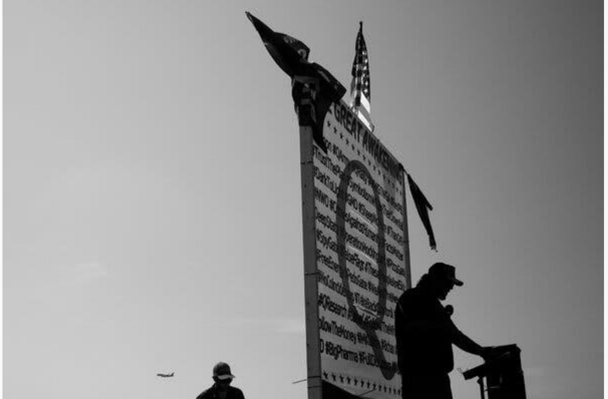
A rally in Washington in 2019 for QAnon, the conspiracy theory movement. Facebook's researchers identified in 2019 that content on the movement was problematic.