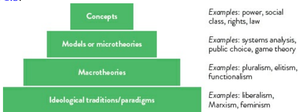
Figure 1.5 Levels of conceptual analysis

Many of these macrotheories reflect the assumptions and beliefs of one or other of the major ideological traditions. These traditions operate in a similar way to the ‘paradigms’ to which Thomas Kuhn refers in The Structure of Scientific Revolutions (1962). In effect, a paradigm constitutes the framework within which the search for knowledge is conducted. According to Kuhn, the natural sciences are dominated at any time by a single paradigm; science develops through a series of ‘revolutions’ in which an old paradigm is replaced by a new one. Political and social enquiry is, however, different, in that it is a battleground of contending and competing paradigms. These paradigms take the form of broad social philosophies, usually called ‘political ideologies’: liberalism, conservatism, socialism, fascism, feminism, and so on (see Chapter 2 ). The various levels of conceptual analysis are shown diagrammatically in Figure 1.5 .