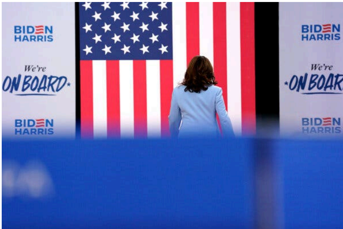
Ms. Harris faced attacks from Republicans almost immediately after being endorsed by Mr. Biden.

But even before Mr. Biden bowed out, fault lines were emerging within the party over how to proceed if he stepped aside. A number of Democrats, including Senator Jon Tester of Montana, who faces a challenging re-election, had indicated that they wanted a competitive nominating process . On Sunday, several Democrats in tough races issued statements about Mr. Biden but made no mention of who should succeed him.