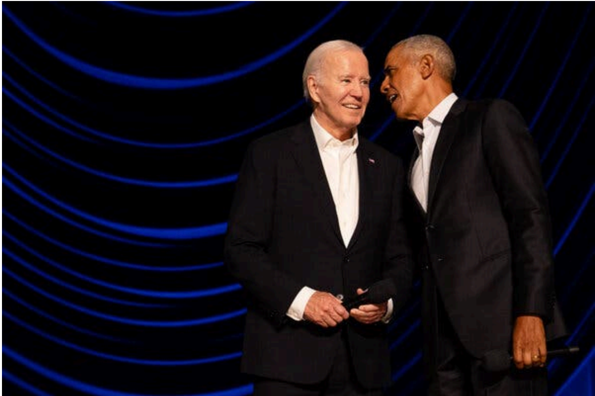
Former President Barack Obama was one prominent Democrat who did not immediately endorse Ms. Harris on Sunday.

Many Democrats felt a palpable sense of enthusiasm and relief. They now see an opportunity to recover from nearly a month of internal battles and a race that seemed headed for catastrophic defeats from the White House all the way down to statehouse races.