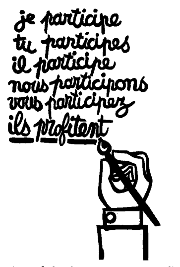
FIGURE 1 French Student Poster. In English, I participate; you participate; he participates; we participate; you participate . . . They profit.

There is a critical difference between going through the empty ritual of participation and having the real power needed to affect the outcome of the process. This difference is brilliantly capsulized in a poster painted last spring by the French students to explain the student-worker rebellion.<sup>2</sup> (See Figure 1.) The poster highlights the fundamental point that participation without redistribution of power is an empty and frustrating process for the powerless. It allows the powerholders to claim that all sides were considered, but makes it possible for only some of those sides to benefit. It maintains the status quo. Essentially, it is what has