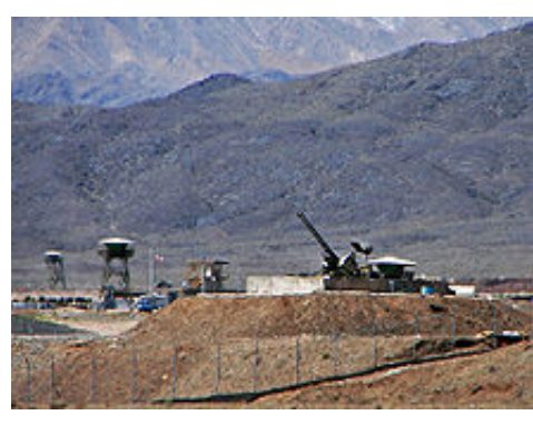
Anti-aircraft guns guarding Natanz Nuclear Facility

The attacks seem designed to force a change in the centrifuge's rotor speed, first raising the speed and then lowering it, likely with the intention of inducing excessive vibrations or distortions that would destroy the centrifuge. If its goal was to quickly destroy all the centrifuges in the FEP [Fuel Enrichment Plant], Stuxnet failed. But if the goal was to destroy a more limited number of centrifuges and set back Iran's progress in operating the FEP, while making detection difficult, it may have succeeded, at least temporarily. [93]