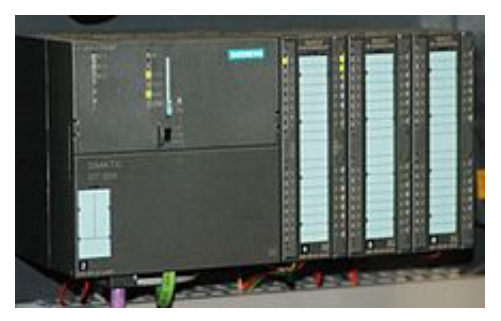
Siemens Simatic S7-300 PLC CPU with three I/O modules attached

based in Iran.<sup>[62]</sup> Furthermore, it monitors the frequency of the attached motors, and only attacks systems that spin between 807 Hz and 1,210 Hz. The industrial applications of motors with these parameters are diverse, and may include pumps or gas centrifuges.