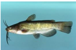
Ameiurus nebulosus (Sumeček americký)