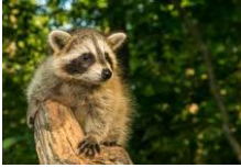
Procyon lotor (Raccoon)