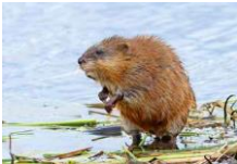
Ondatra zibethicus (Muskrat)