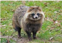
Nyctereutes procyonoides (Raccoon dog)