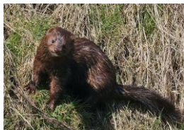
Norek americký (Mustela vison, Neovison vison)