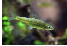
Pseudorasbora parva (Stone moroko)