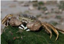
Eriocheir sinensis (Chinese mitten crab)