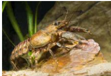
Orconectes limosus (Spiny-cheek crayfish)