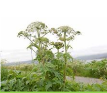
Heracleum persicum (Persian hogweed)