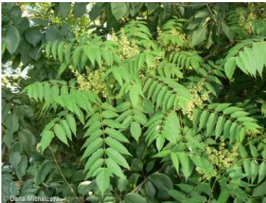
Ailanthus altissima (Pajasan žláznatý)