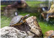
Trachemys scripta (Red-eared, yellow-bellied and Cumberland sliders)