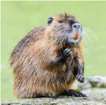
Myocastor coypus (Coypu)