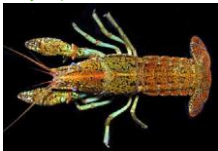
Procambarus fallax f. virginialis (Marbled crayfish)