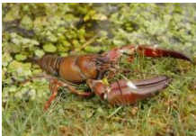
Pacifastacus leniusculus (Signal crayfish)