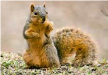
Sciurus niger (Fox squirrel)