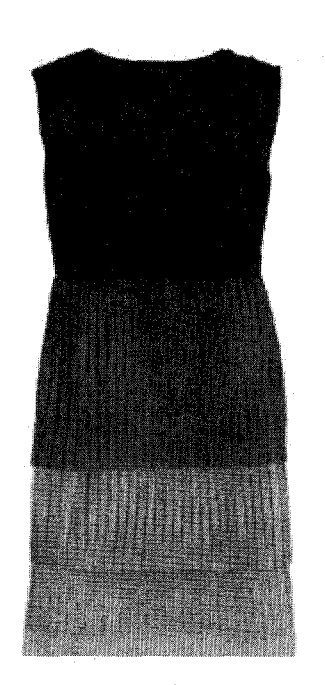
Figure 2. Jonathan Saunders and Forever 21 198