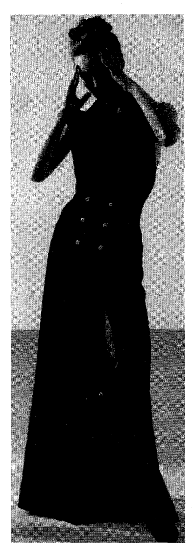
Figure 3. Yves Saint Laurent and Ralph Lauren 199