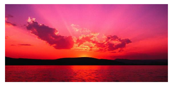
Surface and ground waters are "res nullius"