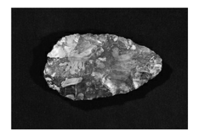
FIGURE 9.2. Acheulean hand axe. (photo credit 9.1)

It's only around 600,000 or 700,000 years ago that we begin to see creatures who may have crossed over. The first hominids with brains as large as ours begin appearing in Africa and then Europe.