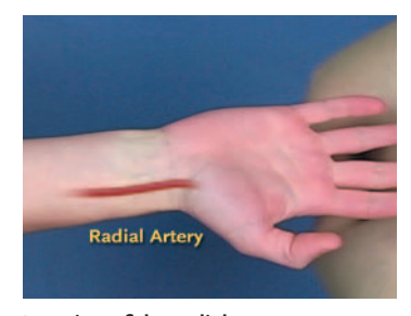
Location of the radial artery.

N Engl J Med 2006;354:e13.