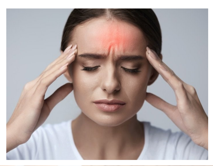
Part 2 Headache