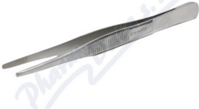
forceps (anatomical, length 14,5 or 16 cm, without hooks!)