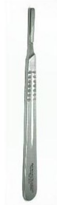
Scalpel (with exchangeable blades, Holder no. 4 and blades no. 21, 23)