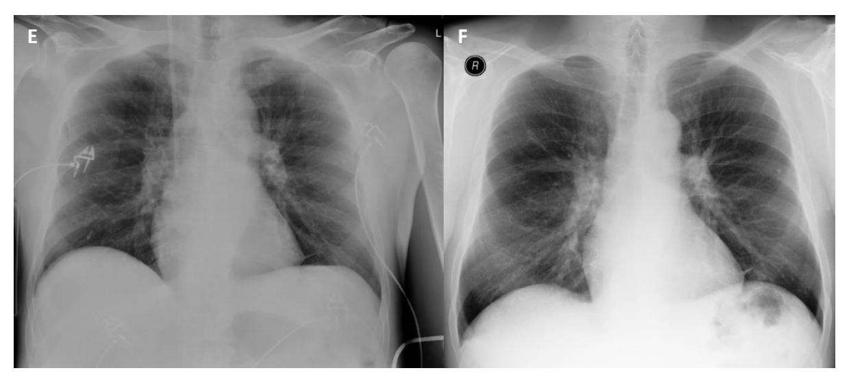
Comparison of quality of chest X-ray from transportable ( Fig. E ) and stationary X-ray machine ( Fig. F ). Picture E has lower quality, artifacts from surface are present (ECG leads). Indicated to confirm position of central venous catheter.