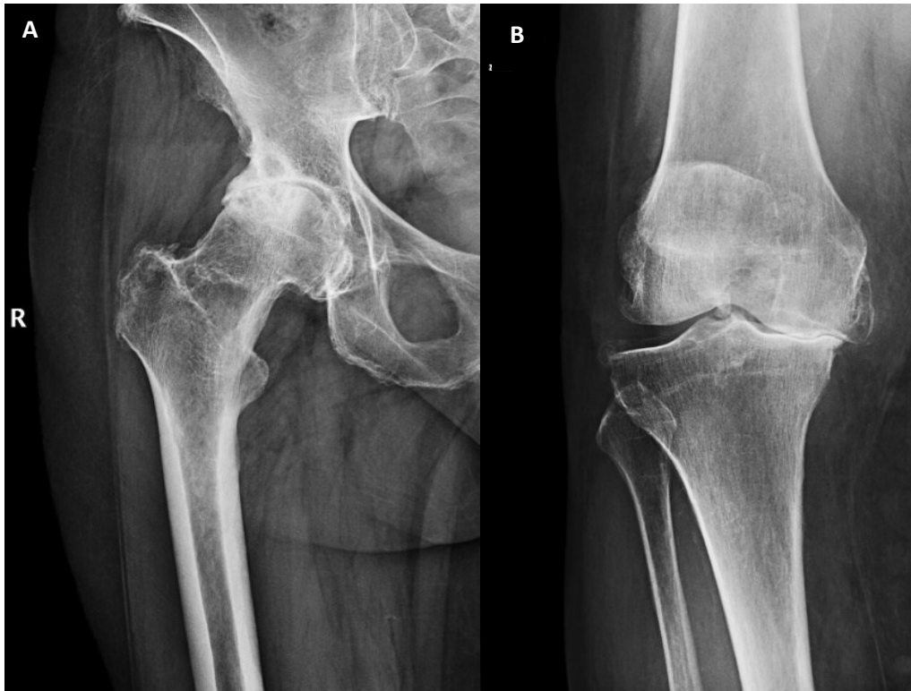
Fig. A – X-ray osteoarthritis of the hip grade 3