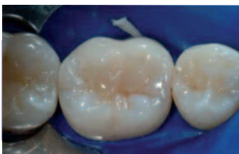
Clinical case by Camillo D'Arcangelo