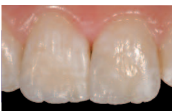
Clinical case by Lorenzo Vanini