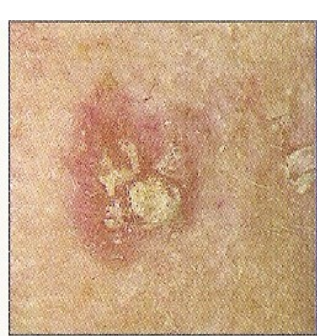
Grade II: Moderately thick hyperkeratosis on background of erythema that are easily felt and seen