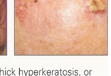
Grade III: Very thick hyperkeratosis, or obvious AK, differential diagnosis includes thick IEC (intra-epidermal carcinoma or SCC)