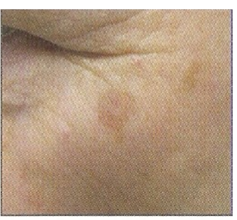
Grade I: Flat, pink maculae without signs of hyperkeratosis and erythema often easier felt than seen. Scale and possible pigmentation may be present