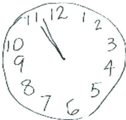
Abnormal Clock (missing number)