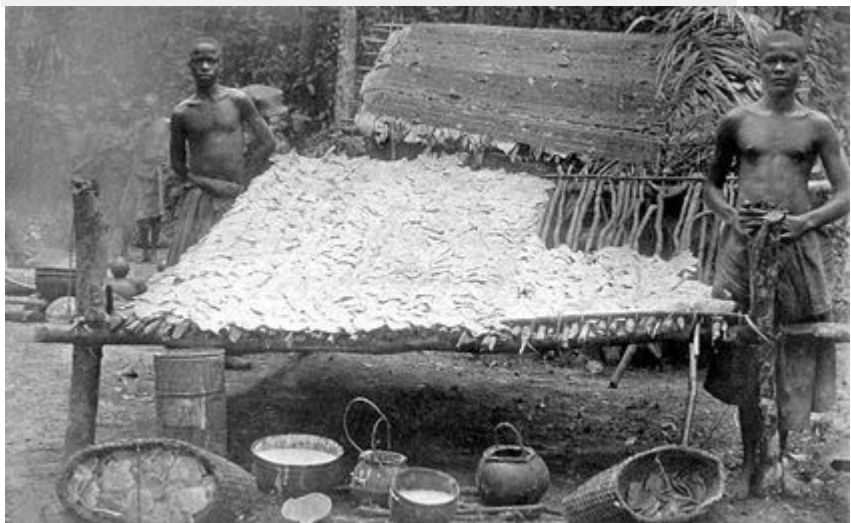
Workers stand next to drying rubber, Belgian Congo.

Often African nations are described as unstable. There is a great deal of truth in this statement as almost all post-colonial African nations have experienced political violence and severe economic mismanagement during the mid and late twentieth century.