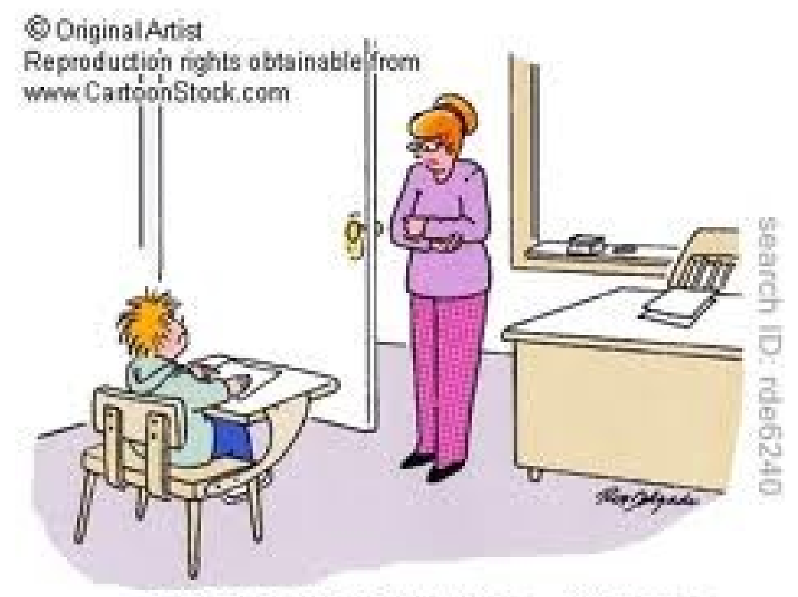
" This is called <u>detention</u> ... it is <u>not</u> a a <u>hostage situation</u>. "

Schools don't have to give parents notice of after school detentions or tell them why a detention has been given