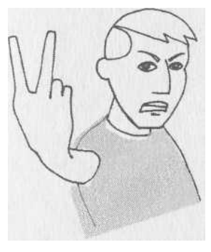
This can mean 'two' to an American, 'Victory' to a German and 'Up yours' in Britain

This sign is common in Australia, New Zealand and Great Britain and carries an 'up yours' interpretation. Winston Churchill popularised the 'V for victory' sign during the Second World War, but his two-fingered version was done with the palm facing out, whereas the palm faces towards the speaker for the obscene insult version.