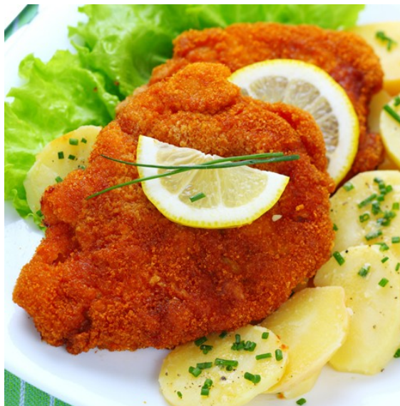
3 Smažený sýr